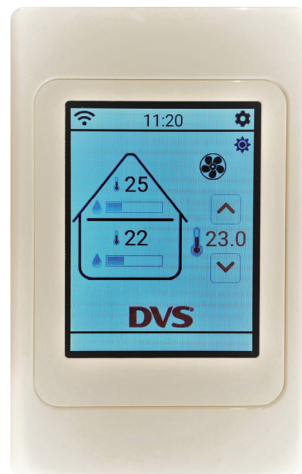
DVS® Premium Connect

The Connect Control systems are WiFi capable and so can be connected to your home internet. This allows you to download any software updates we make available when we are improving our systems.