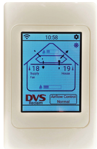
DVS® Reclaim Connect