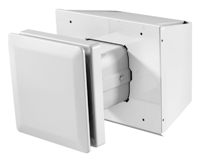
VLR 70 S