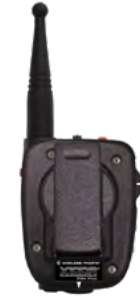
XNMC Non-metal rotary shoulder mount clip - Suit Electrical utilities