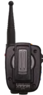
XLMC Standard long rotary shoulder mount clip