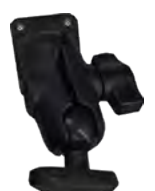
XMDM2 Mobile charger mounting arm