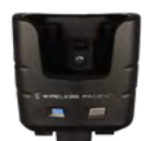
XMVC Mobile charger