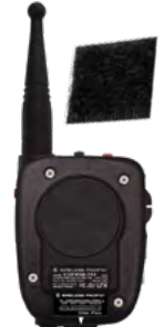
XVMC Velcro® shoulder mount option includes Velcro patch - for best shoulder placement