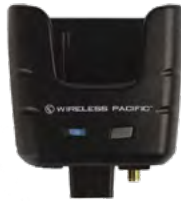
X10DR Elite Plus Standard Gateway