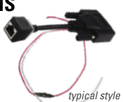
1 x XCA-** Radio adaptor (Required but NOT included) ** refer pricelist for currently available radio adaptors