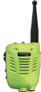
XCFC Custom Front Cover option