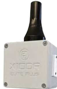
X10DR Elite Plus Rooftop Gateway