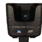
XMVC mobile charger Included with XEX2