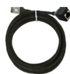
XEC-4.5 4.5 meter Extension interface cable. Order when the radio is trunk mounted. Connects to supplied XIC-1.5 interface cable.(optional)