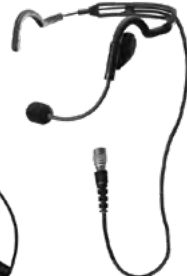
WPHFH-X10 Headset Industrial lightweight