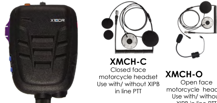
XMCH-C Closed face motorcycle headset Use with/ without XIPB in line PTT XMCH-O Open face motorcycle headset Use with/ without XIPB in line PTT