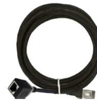
XEC-4.5 4.5m Extension Cable M-F