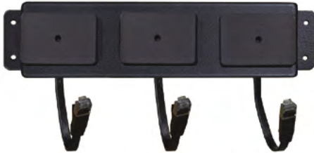
X3MK- X3MK-B 3 way charger mount (B) with DC battery back up Use with XMVC chargers. includes XDCC-RJ and 3 x XIC-0.15