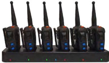
X6WC 6 Way charger