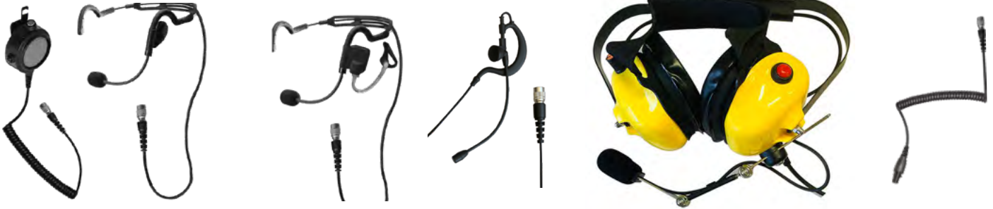
XIPB In-line PTT suits all X10DR audio X10 and XMCH accessories WPHFH-X10 Industrial lightweight noise cancelling headset Use with/without XIPB in line PTT WPATH-X10 Lightweight Acoustic tube headset Use with/without XIPB in line PTT WPULH-X10 Ultra light headset Use with/ without XIPB in line PTT WPSHD-F Industrial heavy duty noise cancelling headset Use with/without XIPB in line PTT WPFHC-X10 WPSHD or PeltorFLX2 Headset to Hirose cable