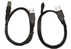
XFPK Field Programming kit