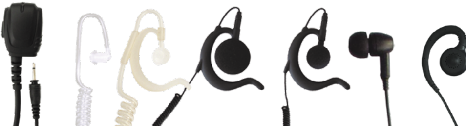
WPiTRQ-X10 WPTEP-TL WPTEH-TL WPEH-TL WPBEH-TL WPEB-TL WPLEH-TL Advanced Ear Mic with 2.5mm twist and lock ear receivers