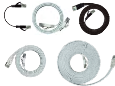
XIC-0.15 0.15m Interface (blk) Cable XIC-0.4 0.4m Interface (wh) Cable XIC-1.5 1.5m Interface (blk) Cable XIC-1.8 1.8m Interface (wh) Cable XIC-6.0 6m Interface (wh) Cable