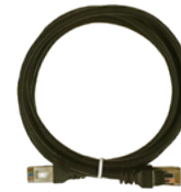
XIC-0.5 0.5m Interface Cable XIC-6.2 6.2m Interface Cable