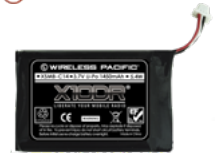
XSMB-C14 Replacement Battery 1450mA Li-Pol