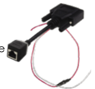
XCA-** Plus Type 1 Connects to Radio interface connector ** specific radio suffix