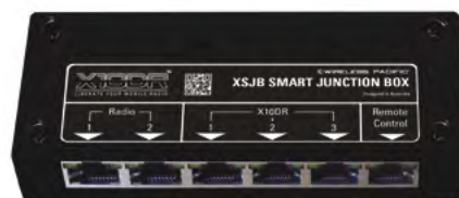
XSJB (V2) Dual Radio junction box 3 Gateway/ 2 Radio