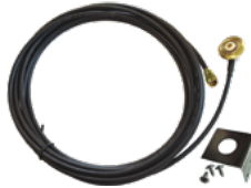
XSMA2 Replacement Elite/Pro X10DR handset/in-vehicle gateway antenna