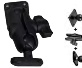
XMDM2 Multi directional mount for gateway/X1WK/XMVC