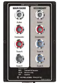
XCCP Firefront™ Console