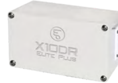
XICB-EXT Firefront Smart Box IP67 External mount