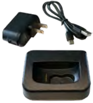
XDTC Desktop Charger