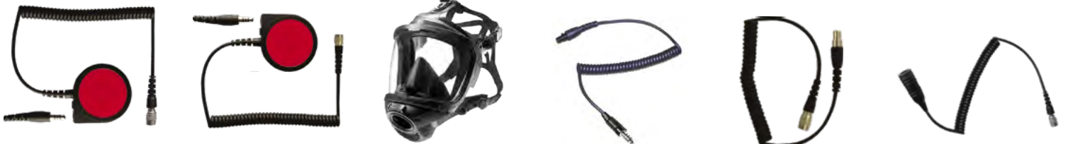
WPWLP-X10 Large in-line PTT pad with wireless ring PTT for Nexus plug WPWLP-X10D Large In-Line PTT -for Draeger or similar Breathing Apparatus For reference only Purchase elsewhere WPSHC-NEX WPSHD Headset to Nexus plug WPFLEX-X10 Peltor Flex headset interface cable WPNEX-X10 Peltor™ J11 interface cable