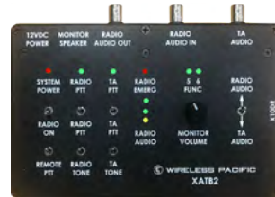
XATB2 Advanced Test Box includes AC/12vdc power supply and XMS speaker