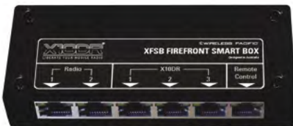
XFSB Firefront smart box 3 Gateway/ 2 Radio