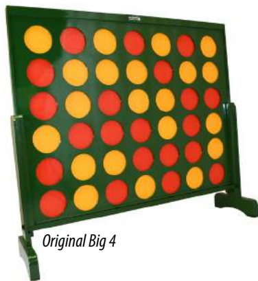
Original Big 4