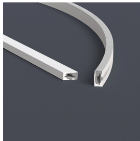
Model: VBD-N0612-SD-W SKU: 666561432980