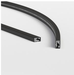
Model: VBD-N0612-SD-B SKU: 666561432935