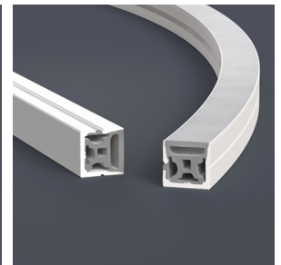
Model: VBD-N2020-SFD-W SKU: 666561432881

For more information about our products and services, please visit our website: www.veroboard.com