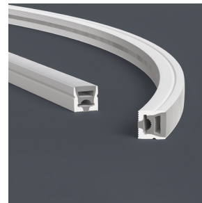
Model: VBD-N1212-SF-W SKU: 666561432737