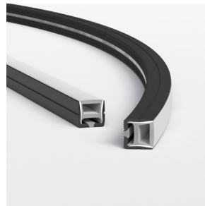
Model: VBD-N1212-SF-B SKU: 666561432683