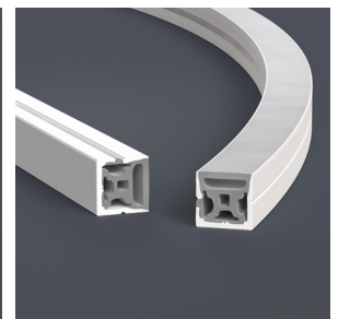
Model: VBD-N2020-SFD-W SKU: 666561432881

For more information about our products and services, please visit our website: www.veroboard.com