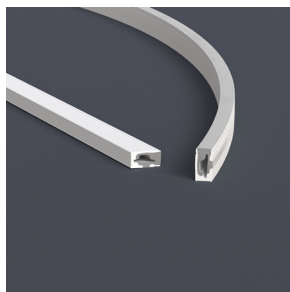
Model: VBD-N0612-SD-W SKU: 666561432980