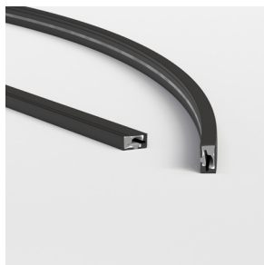
Model: VBD-N0612-SD-B SKU: 666561432935