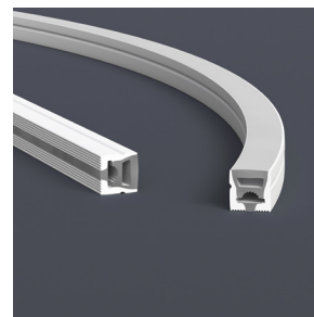
Model: VBD-N1212-SF-W SKU: 666561432737