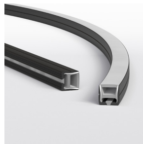
Model: VBD-N1212-SF-B SKU: 666561432683