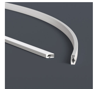
Model: VBD-N0410-SD-W SKU: 666561432614