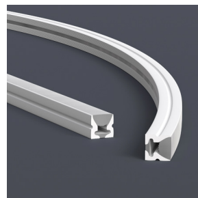
Model: VBD-N1010-SF-W SKU: 666561432676