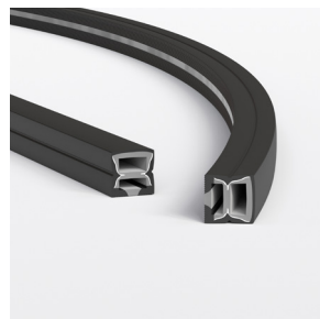
Model: VBD-N1010-SF-B SKU: 666561432621

COMPATIBLE SILICONE NEON CHANNELS (Sold Separately)