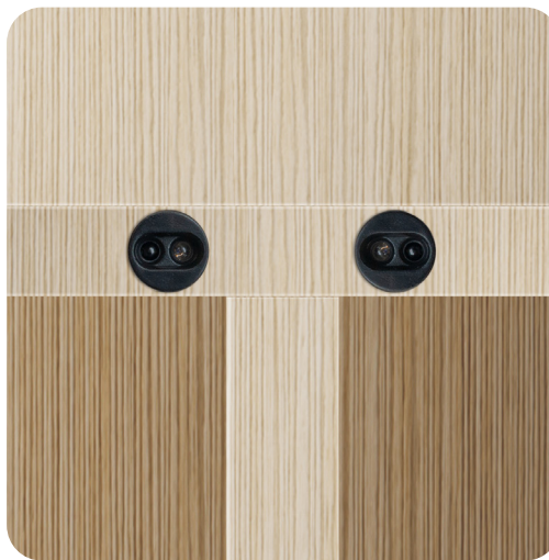
• Recessed installation drill hole 10mm