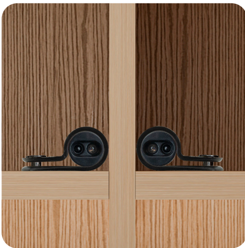
• Surface installation with screw