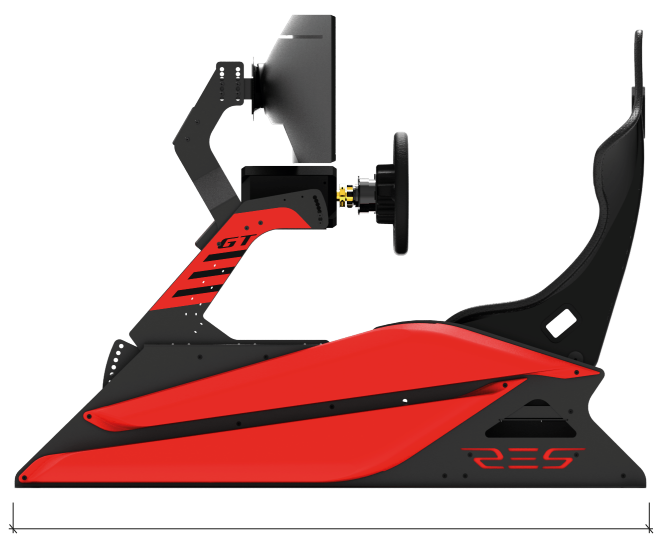
158 cm (62,2 in)