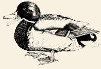
Free Run Duck