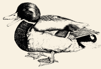
Free Run Duck