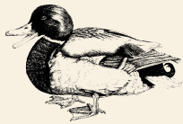
Free Run Duck