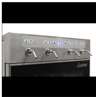
Four Dispensing Spouts