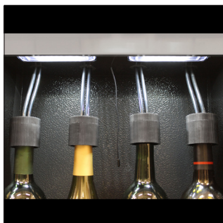
White Interior Lighting