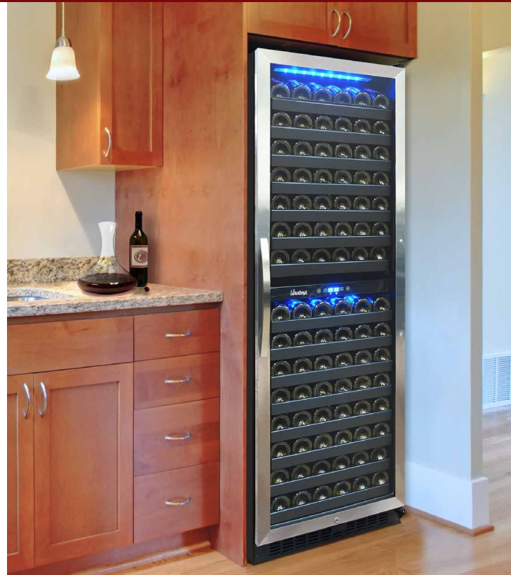
Centrally located control panel