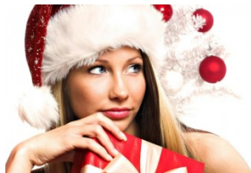
Christmas Gift Ideas For Women 2016