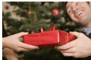
Christmas Gift Ideas For Men 2016