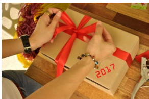
New Year Gift Guide 2017