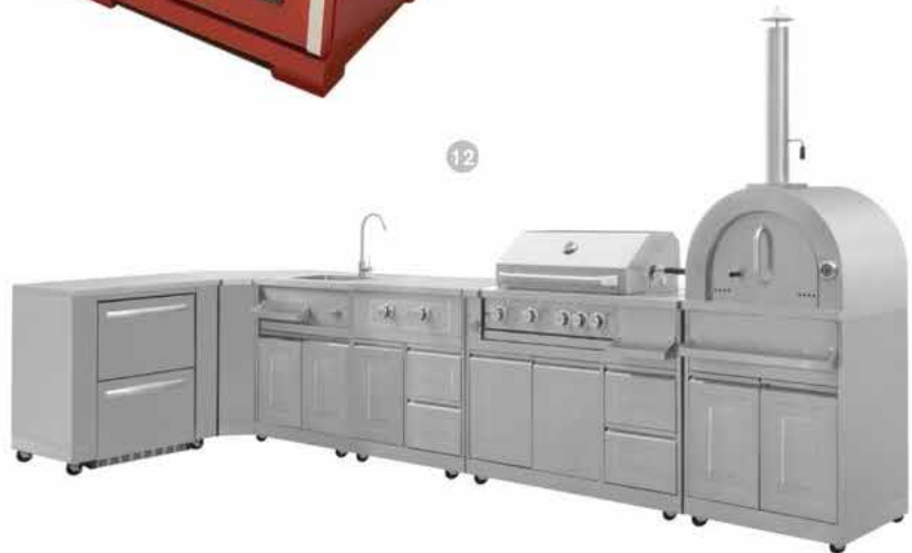
7 Speed Queen Front Load Laundry Pair / www.speedqueen.com 8 Zephyr Presrv™ Dual Zone Wine Cooler in Black Stainless Steel - MSRP: $1,599 / www.zephyronline.com 9 Forza 36" Pro-Style Hood and Gas Range with Island Trim / www.forzacucina.com 10 Caliber 72" Line of Ultra-Customizable Ranges / www.caliberappliances.com 11 Vinotemp Garage 300-Bottle Dual-Zone Wine Cooler / www.vinotemp.com 12 Thor Kitchen Pro-Style 8-Piece Modular Outdoor Kitchen Suite / www.thorkitchen.com