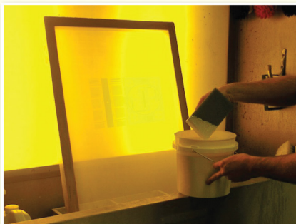
Step 1. Apply WhiteOut to both sides of the screen.