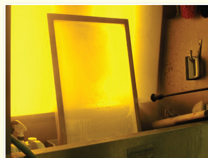
Step 3. High pressure rinse - starting at bottom.