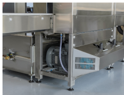
Adjustable high-pressure pump