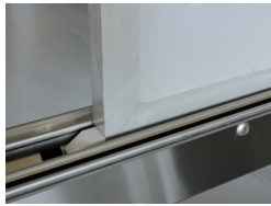
Frame transport chain