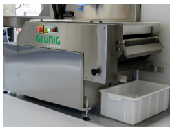
Inclined filter (optional)