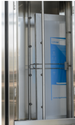
Rinsing module for soften up the emulsion