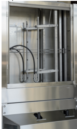
Oscillating nozzles on both sides of the screen