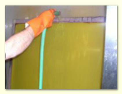
3. Flood rinse the screen starting at the top and washing all residue off the screen.

2. Scrub screen with nonabrasive pad or brush.