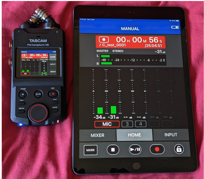
The Bluetooth adaptor is available separately and allows communication with a free iOS/Android remote control app.

X6 and the X8 using the same GUI, but laid out on a much larger screen — and remotely at that! This is particularly useful for the Manual app, as you can imagine. This app, which is free to download, is common to the X6 and X8, and those elements of the X8 GUI that aren't present on the X6 are greyed out.