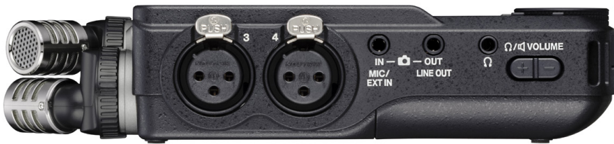
■ The Portacapture X6 can capture two external mics, with the XLRs capable of delivering phantom power and the stereo mini-jack input capable of plug-in power.

» normal stereo recordings. Well, who'd have guessed that!