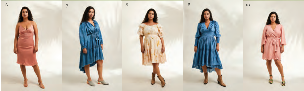
MODEL TOMIE IS 5'8" AND WEARING A SIZE 12