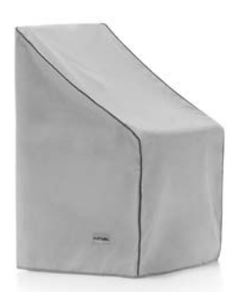
Protective rain cover in light gray color