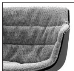
Flow Slim padded

With customer's own leather, in order that the product is properly manufactured, the leather piece must be with no defects, such as scars or holes.