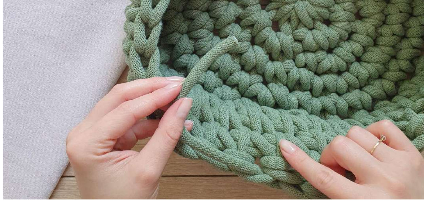
Step 15 Hide the cord between loops:)