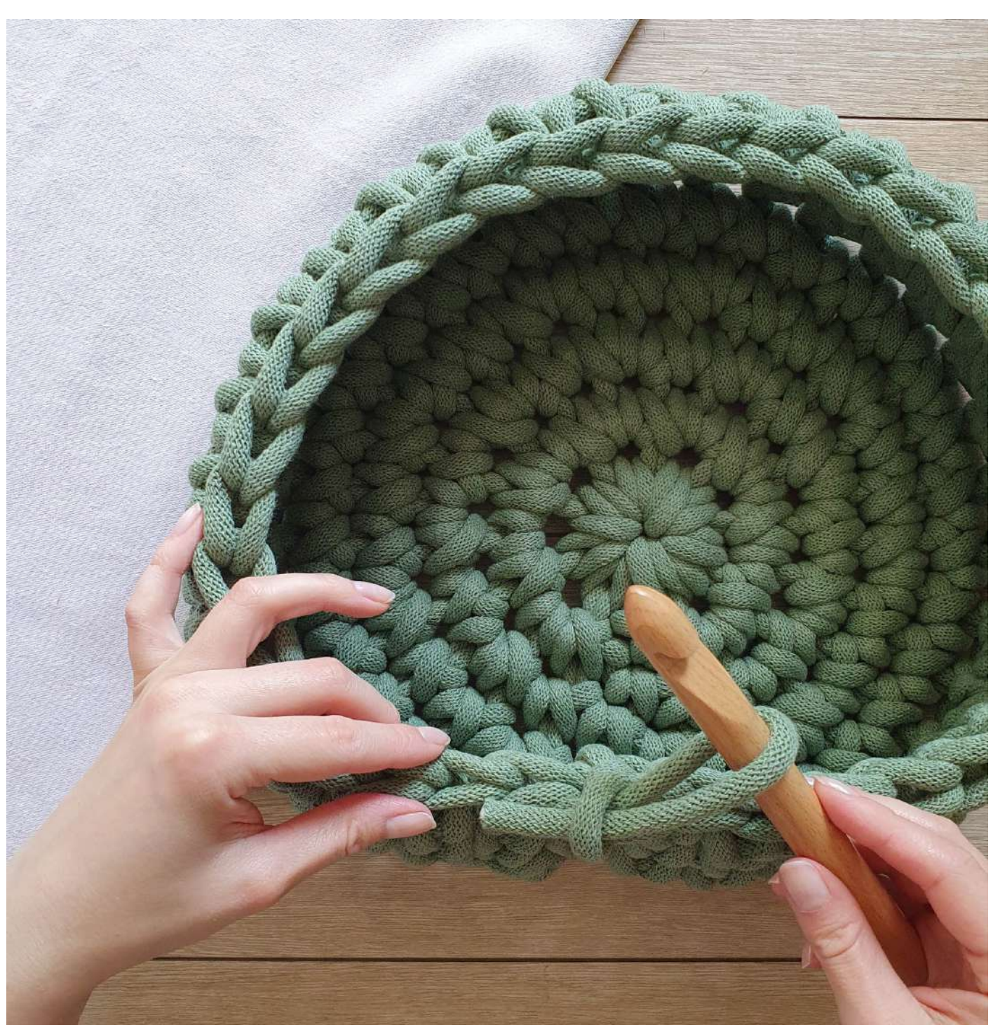
Step 14 Pull the loop and pull out the cord.