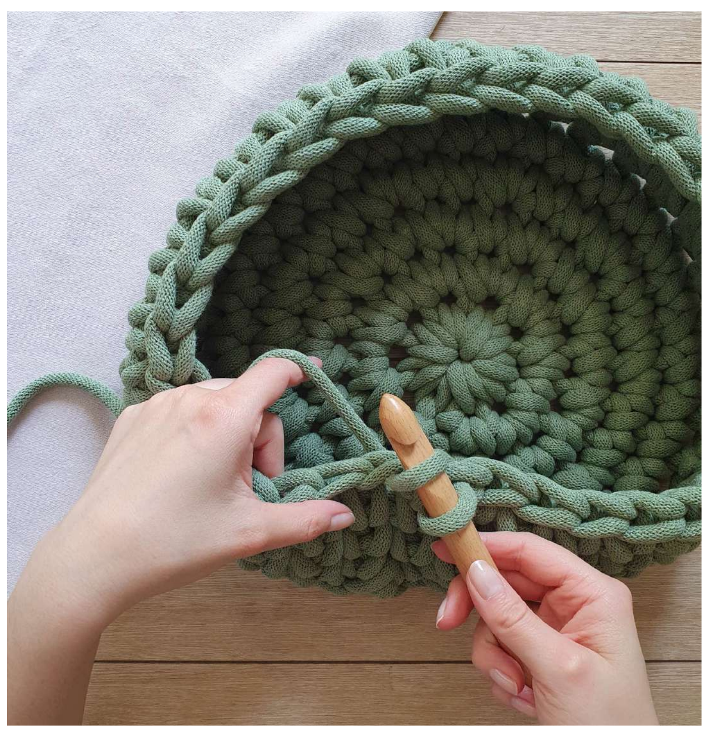
Step 12 Let's make two more rounds!