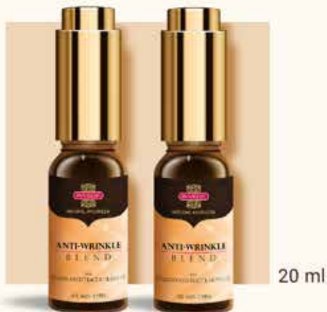
Anti Wrinkle Blend | Pack of Two The goal is to restore youthful appearance while still looking natural.