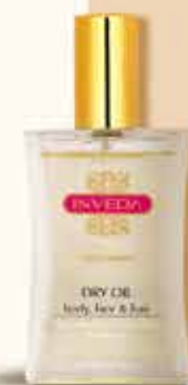
Dry Oil | Body, Face & Hair Hydration Treatment

Ultra-lightweight & luxurious blend of oils for intensive treatment for lacklustre face, body & hair