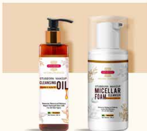
AM-PM Anti Makeup Remover Regimen

Effortlessly & gently dissolves stubborn impurities while nourishing and brightening your skin.