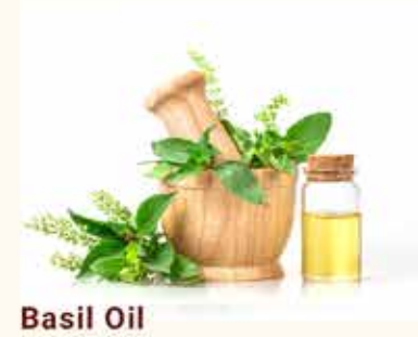
Basil Oil Enhances Complexion