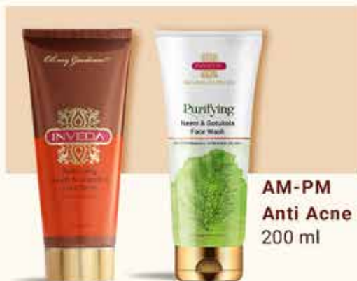
AM-PM Anti Acne Face Wash 200 ml

Prevent regular breakouts of acne and pimples. Additionally, in the evening Lemon & Grapefruit controls excessive oil & lightens dark spots.