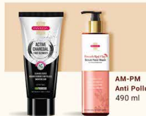
AM-PM Anti Pollution Face Wash 490 ml

Prevent regular breakouts of acne and pimples. Additionally, in the evening Lemon & Grapefruit controls excessive oil & lightens dark spots.