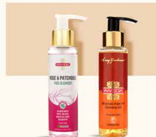
AM-PM pH Balancer Face Wash

Balances skin's pH in no time & imparts a luxurious cleansing experience.