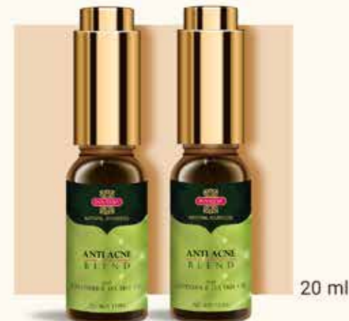
Anti Acne Blend | Pack of Two A perfect solution for all types of acne (Papules, pustules, cystic, blackheads & whiteheads) and acne scars.