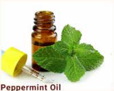
Peppermint Oil Reduces Pigmentation