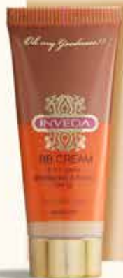
BB Cream (Matt & Fair)