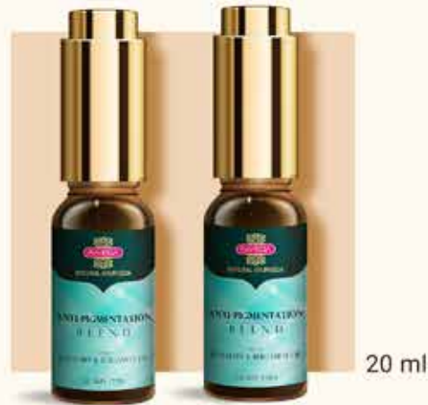
Anti Pigmentation Blend | Pack of Two An advanced solution of Ayurvedic technology that provides you results in 50-60 days