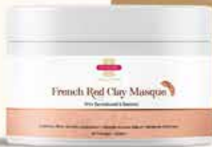
French Red Clay Masque

Boosts self esteem, confidence & mental strength immediately. It keeps skin healthy, evens out skin color & prevents ageing. 10ml