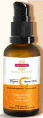
Concentrated Vitamin C Serum 20%

Cures hyperpigmentation, dark spots, evens skin tone, protects from UV rays, reduces dark circles, promotes collagen, prevents skin ageing, boosts wound healing. 30ml