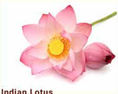
Indian Lotus Heals flaky dry skin