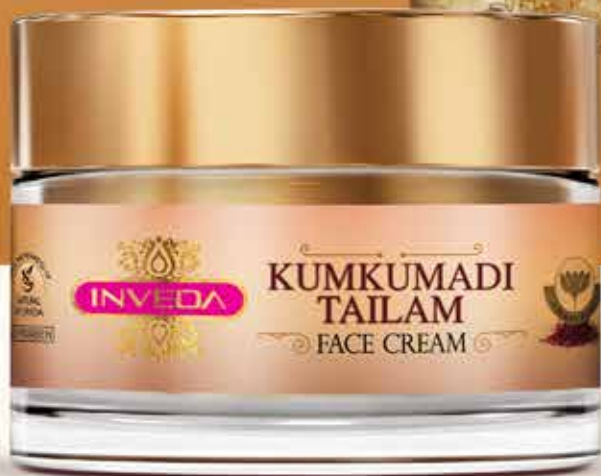
Kumkumadi Tailam Face Cream