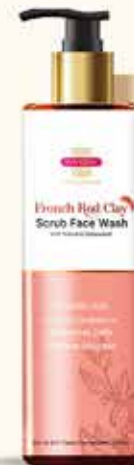
French Red Clay 2 in 1 Scrub Face Wash

Inspired by Egyptian therapy that provides home spa experience for silky, clear and refined complexion. 200ml