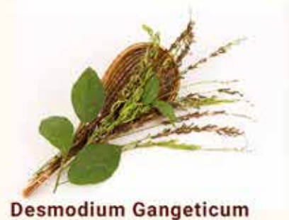
Desmodium Gangeticum Soothes skin