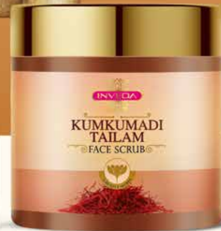
Kumkumadi Tailam Face Scrub

The all in one, luxurious skin care regimen with more than 25 herbs to prevents 9 major skin problems Acne & acne spots | Hyper pigmentation | Dull skin | Sun tan | Dark circle | Bruises | Blemishes | Wrinkles | Infection