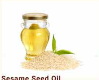
Sesame Seed Oil Rich in vitamin E, protect skin from harmful toxins