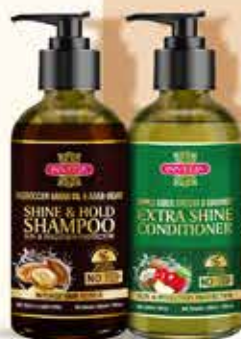
Anti Hairfall Expert Kit