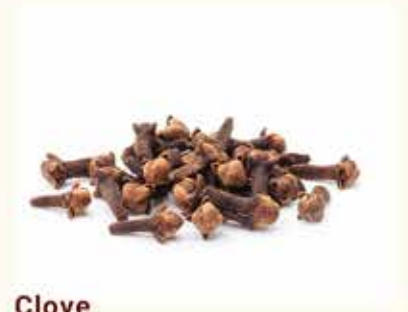
Clove Reduces Blemishes