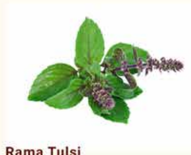
Rama Tulsi Calms Skin infections & treat tan & acne