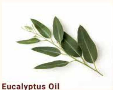
Eucalyptus Oil Best for boosting collagen