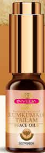
Kumkumadi Tailam Face Oil