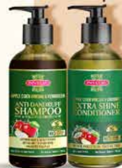
Anti Dandruff Expert Kit