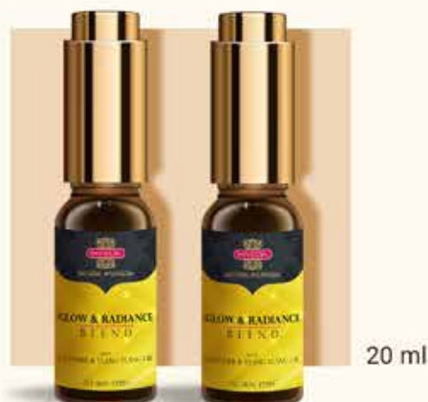
Anti Wrinkle Blend | Pack of Two The goal is to restore youthful appearance while still looking natural.