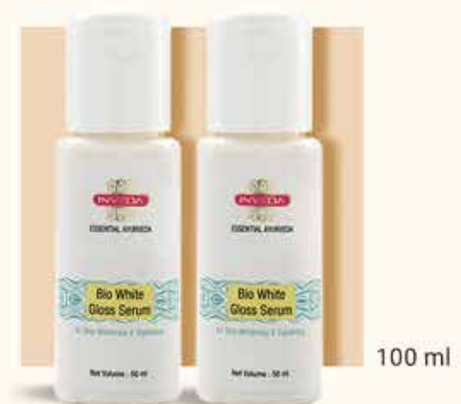
Anti Wrinkle Blend | Pack of Two It makes skin cells healthier, resulting in increased natural radiance and skin glow.