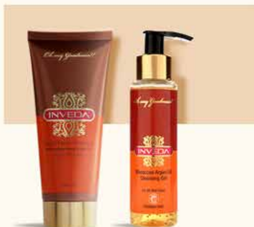
AM-PM Anti Wrinkle Face Wash

Anti pollution face wash regimen cleanses the settled pollutants from the clogged pores that even normal face wash cannot do resulting in detoxified, fresh skin.