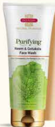
Neem & Gotukola Face Wash Anti Acne