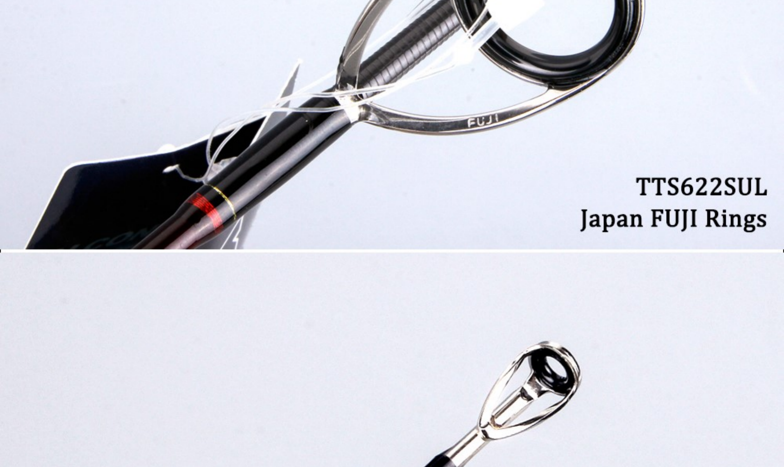
TTS622SUL Japan FUJI Rings