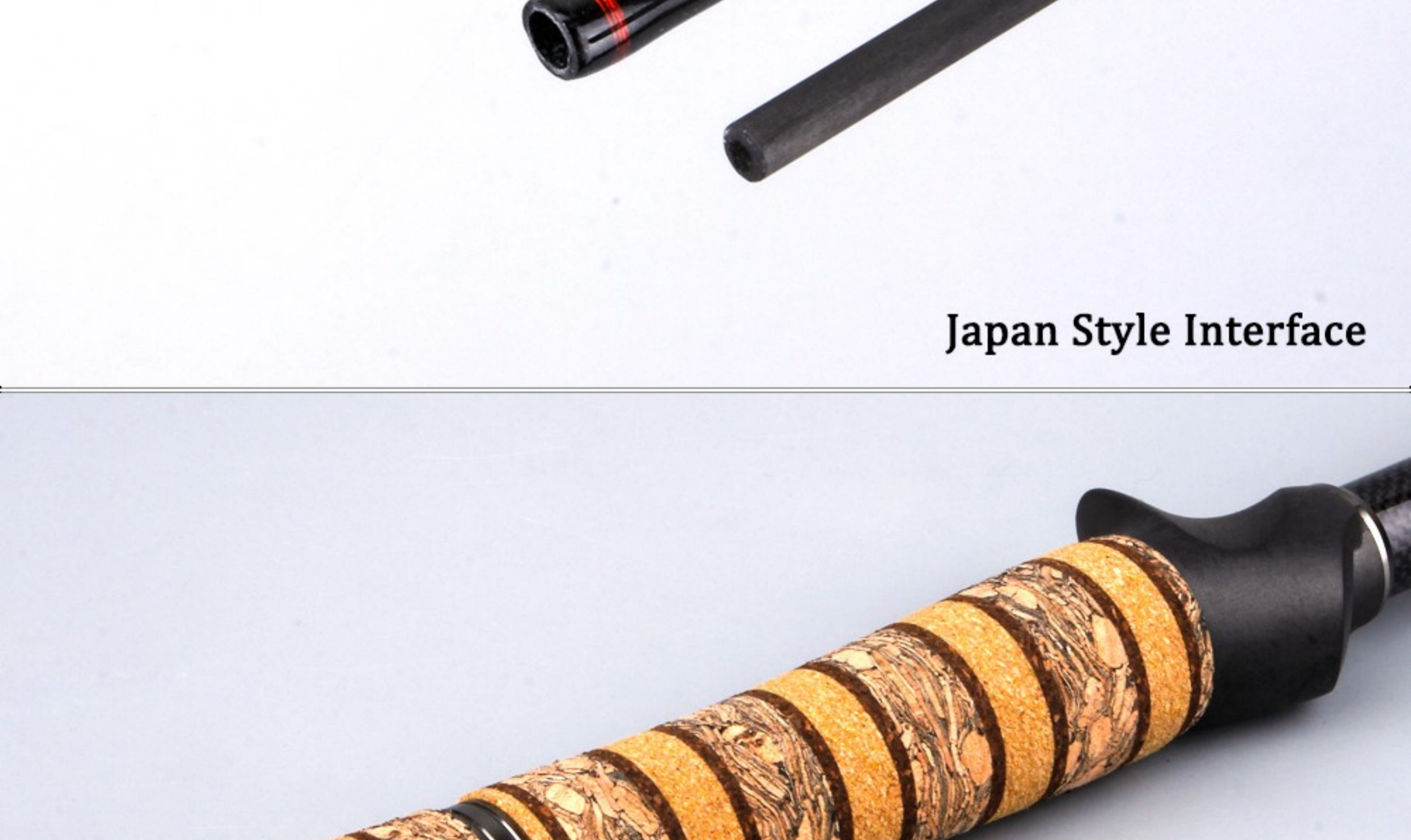
Japan Style Interface