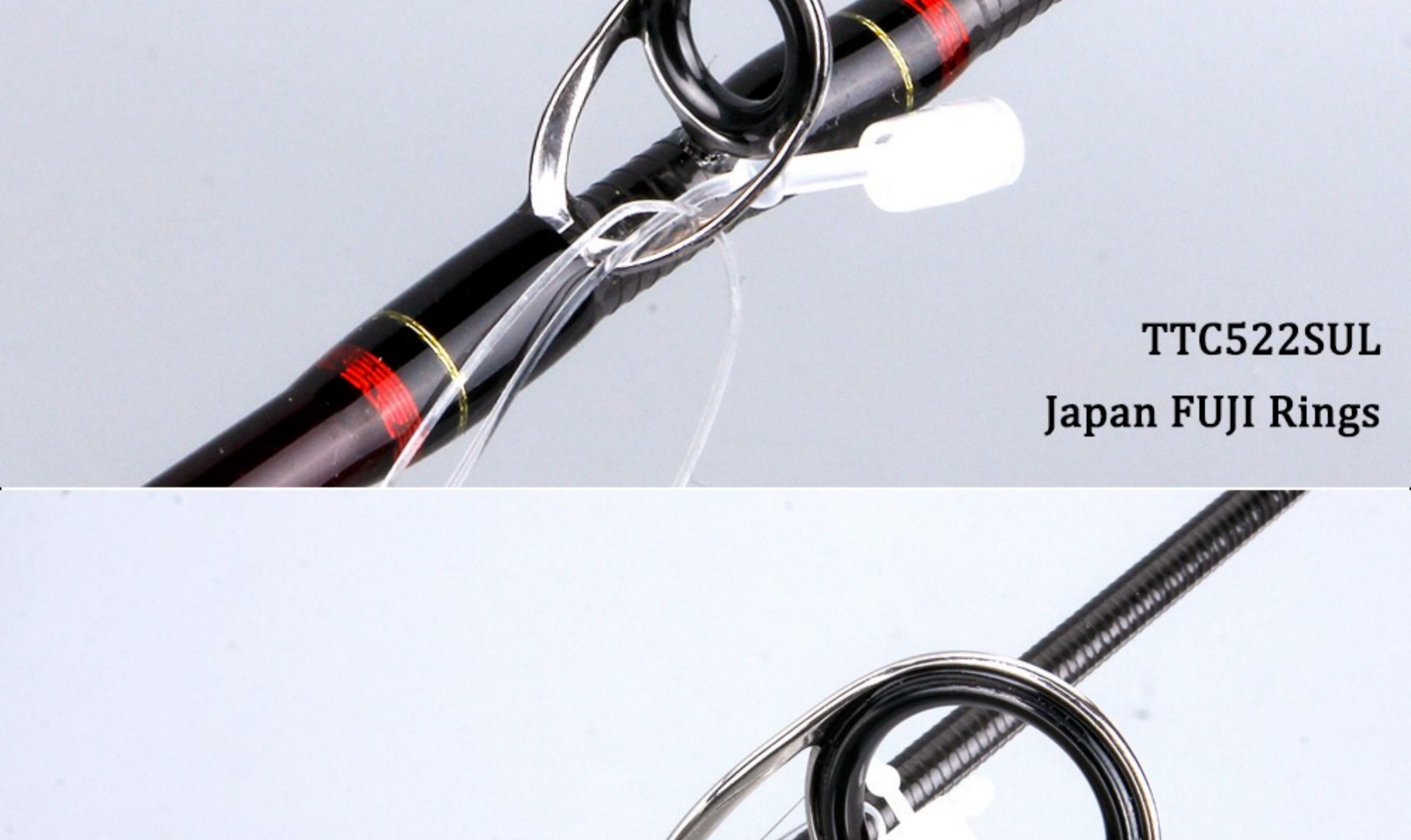
TTC522SUL Japan FUJI Rings