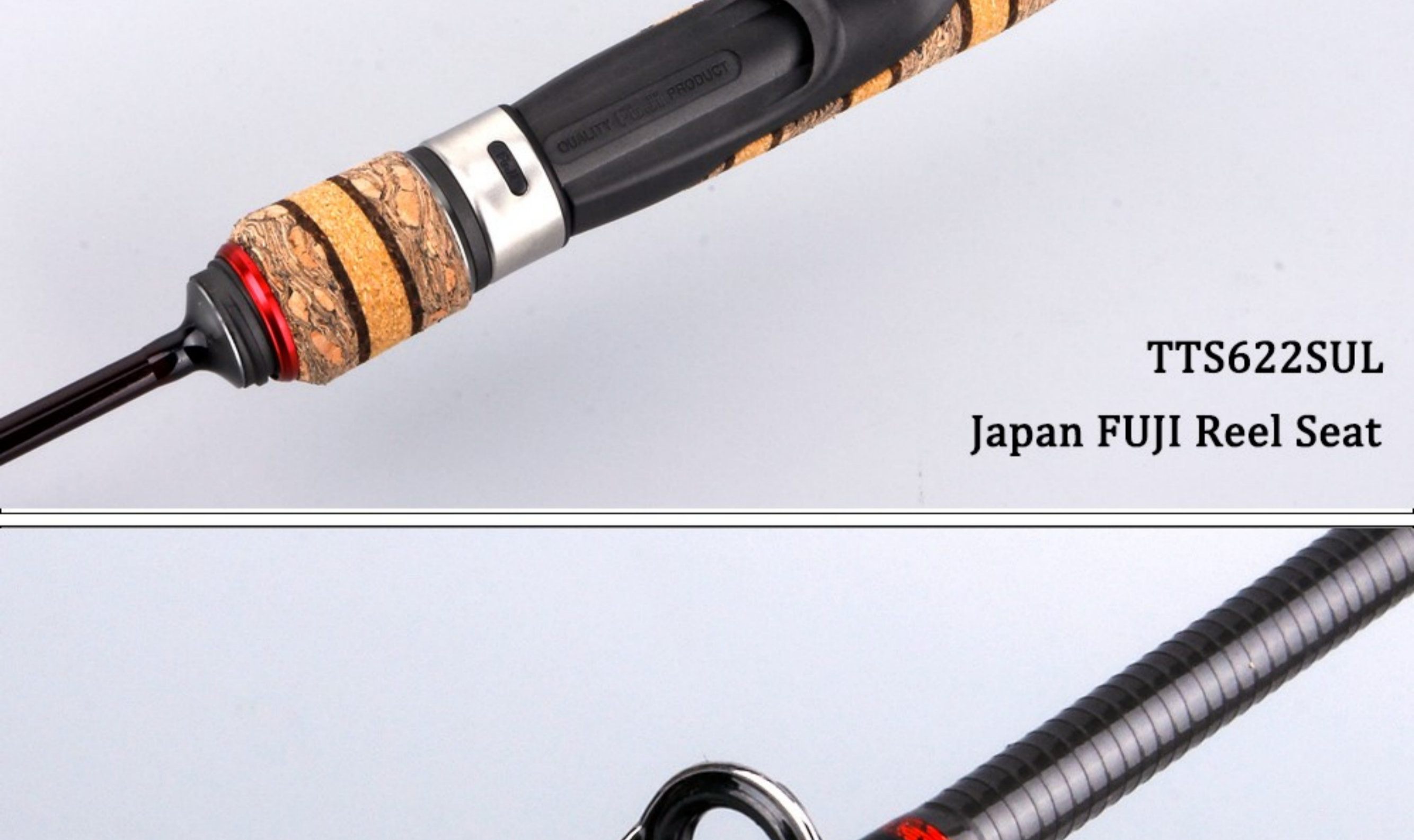
TTS622SUL Japan FUJI Reel Seat