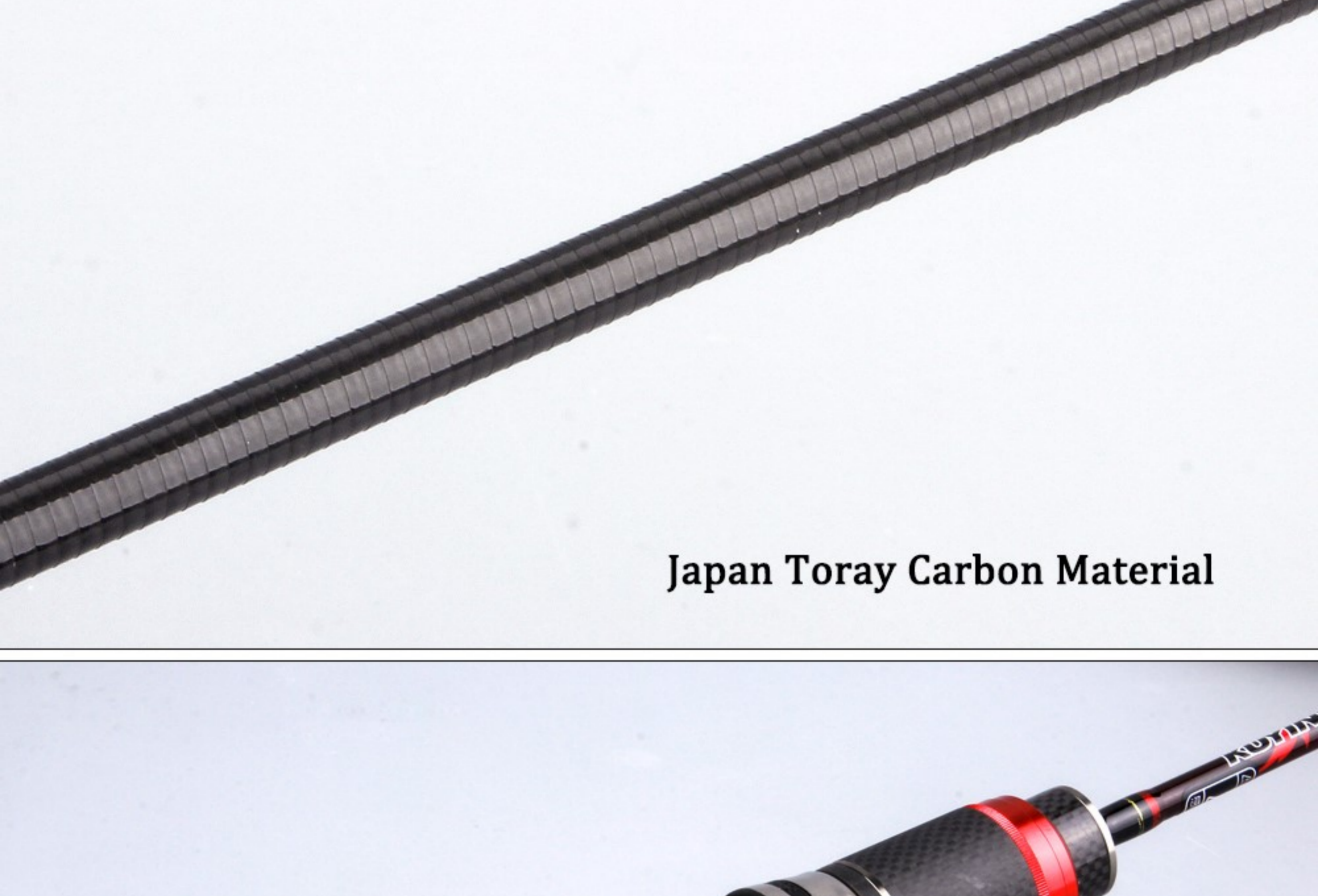
Japan Toray Carbon Material