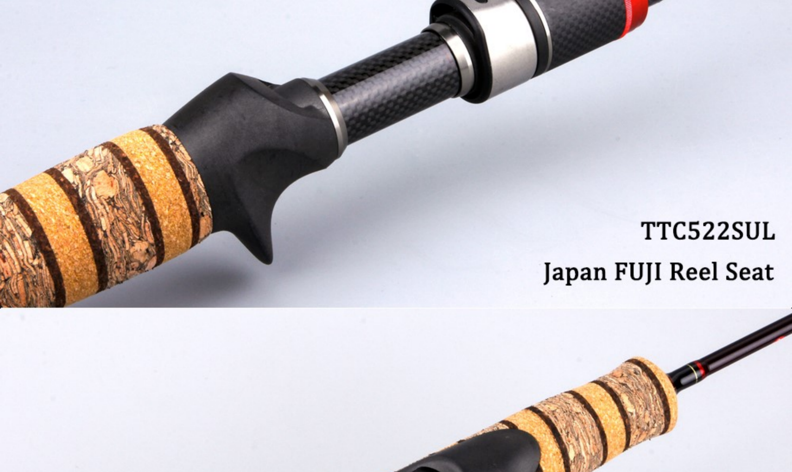
TTC522SUL Japan FUJI Reel Seat