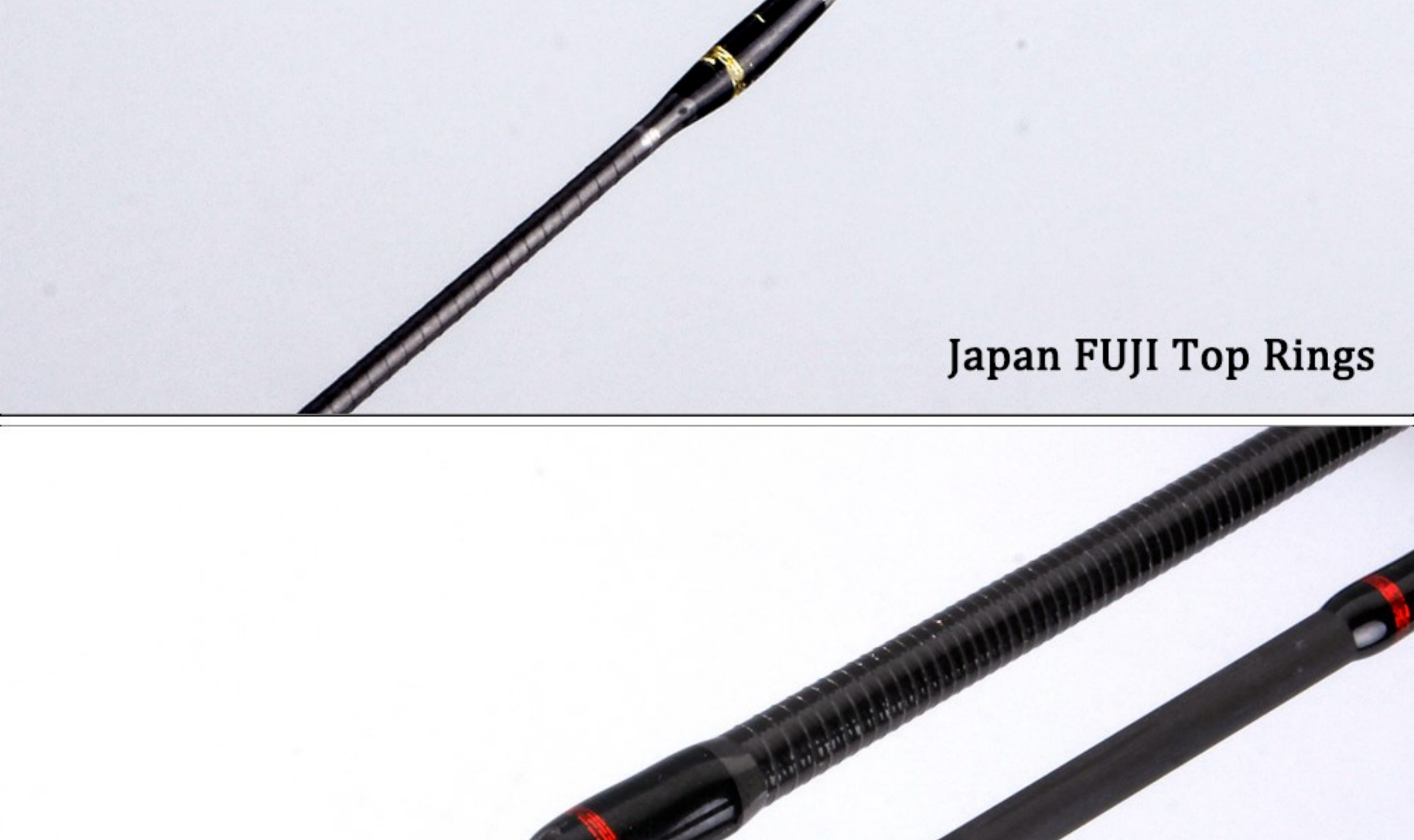
Japan FUJI Top Rings