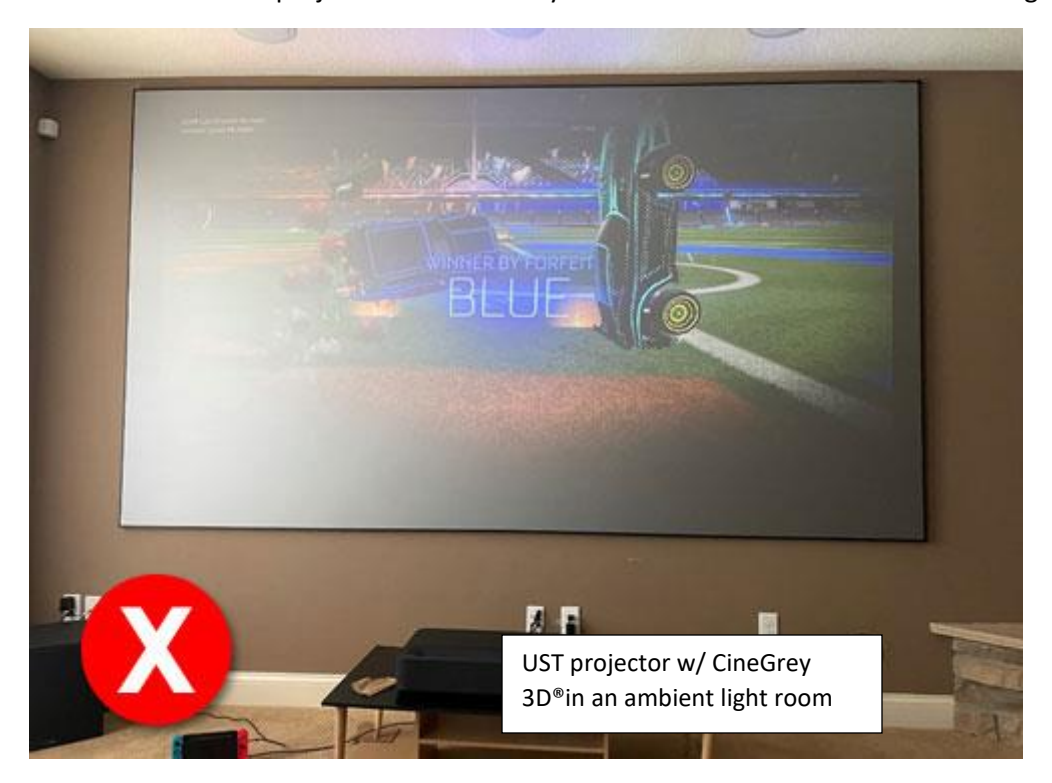
Image below shows how a UST projector with CineGrey 3D looks like in a room with ambient light.

A: The CineGrey 3D®/CineGrey 5D® are angular reflective front projection materials that reflect at the mirror-opposite angle. If an ultra-short throw projector is used, the material will reflect the steep narrow light and reflect it upwards instead of to the viewer's eye level. As you can see from the picture, the image looks foggy and unwatchable due to the projector's light being reflected in the wrong direction. The material is reflecting and absorbing and treating it as ambient light.