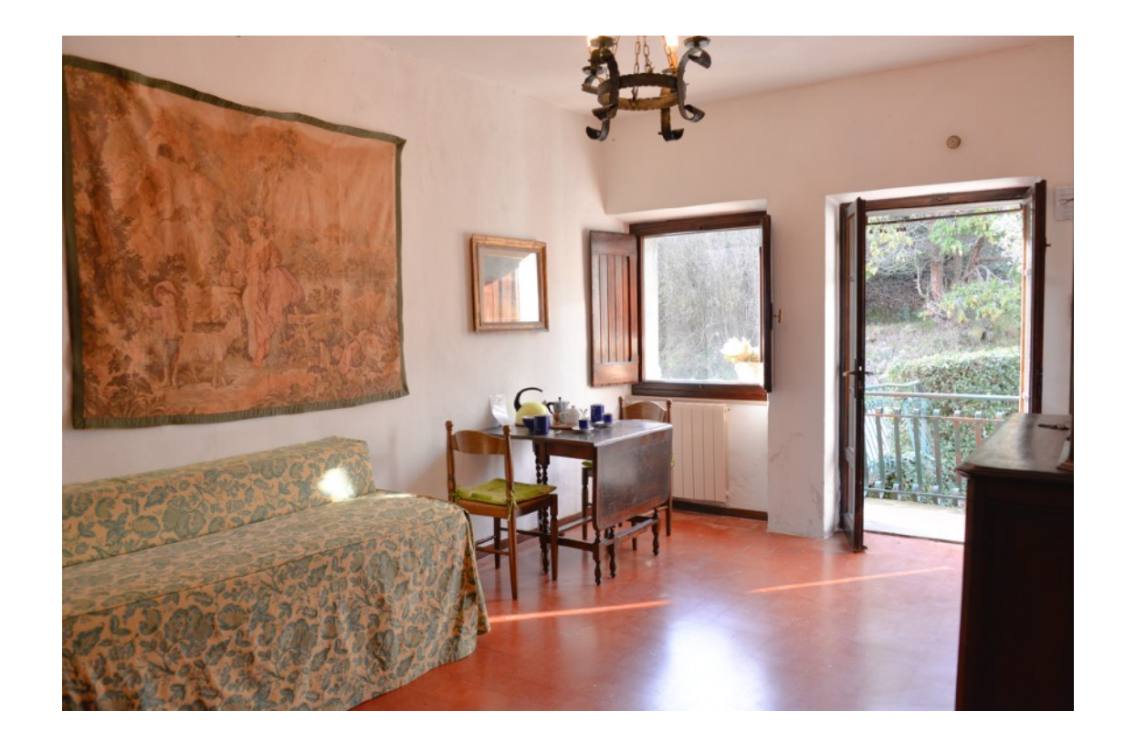
<u>1 Double + 2 Singles</u> Double Bed Single Occupancy- $3600 Double Bed Double Occupancy- $2950 (Shared bed) Single Bed - $3150

Outside table and chairs are on the lawn of the garden, five meters from the entrance door.