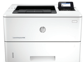
HP LaserJet Enterprise M506dn