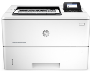
HP LaserJet Enterprise M506n

Finish tasks faster with a printer that starts right away and helps conserve energy. 1 Multi-level device security helps protect from threats. 7 Original HP Toner cartridges with JetIntelligence and this printer produce more high-quality pages. 2