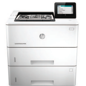
HP LaserJet Enterprise M506x