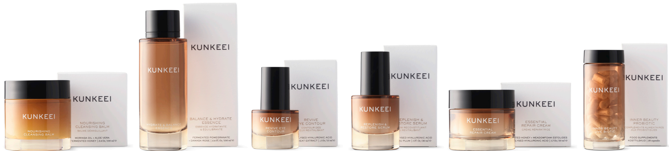
NOURISHING CLEANSING BALM