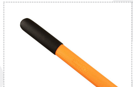
Rubber End Grip