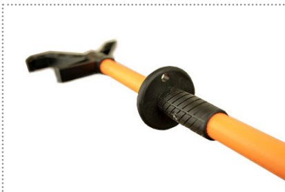
Hand Guard with Tethering Point

Passed third-party high voltage ASTM F3121 Section 6.3 75 kV/ft. 60Hz test