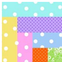
Make 10 Blocks 7 1/2" x 7 1/2"

Repeat steps 1 through 6 with the remaining log cabin block pieces to make 10 completed log cabin blocks.