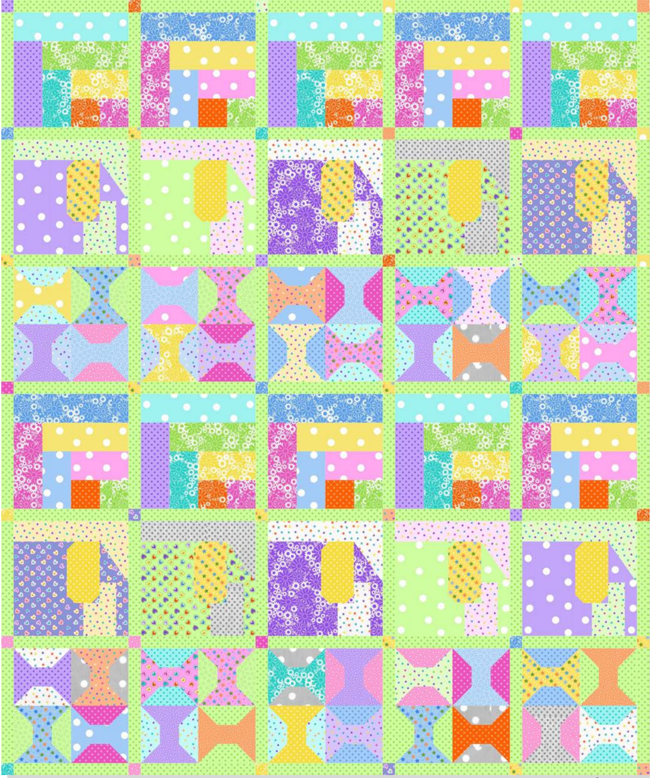
Finished Size 39 1/2" x 47 1/4"