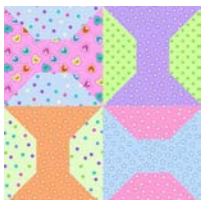
Make 10 Blocks 7 1/2" x 7 1/2"

Repeat steps 1 through 3 to make 10 completed spool blocks.