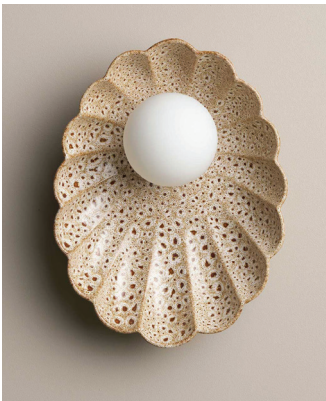
225602 WHITE OCHRE