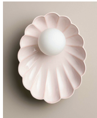
225603 ROSE QUARTZ (ONLINE EXCLUSIVE)

Due to the nature of clay and our manufacturing process, variations on shade, colour, and size are a natural feature of ceramic product fired at high temperature.