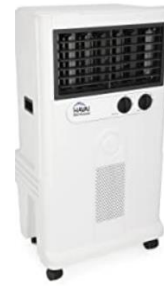
HAVAI Slim Personal