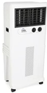
HAVAI Slim Personal XL

Correct! HAVAI Air Coolers work most effectively in hot, dry climates. HAVAI Air Coolers release a comfortable, cool breeze with the natural process of water evaporation. When warm air is drawn into the air cooler, the air is filtered through a wet honeycomb cooling medium, which absorbs heat and naturally cools and humidifies the air.