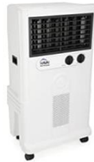
HAVA Slim Personal