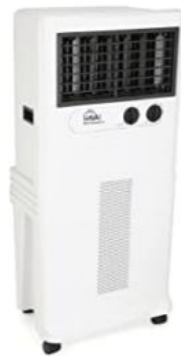
HAVA Slim Personal XL