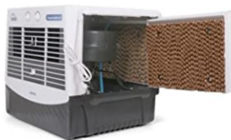
DENSE THREE SIDE HONEYCOMB FOR GOOD COOLING

3 PIN POWERCORD USED All our Air Coolers come with 3 Pin Powercords to ensure safety first and also it helps that a 3 Pin fits well into the socket and does not come out or become loose over a period of time.