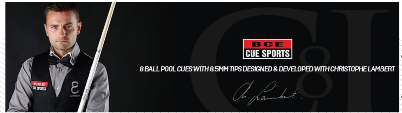
BSP-5B AED 400