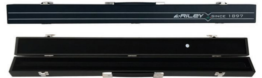
RCC3-SE AED350 Riley Attaché Case For 3 Piece Cue & Extension