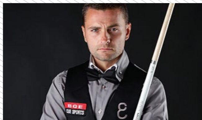
CLR-3 "VICTORY" AED1,900