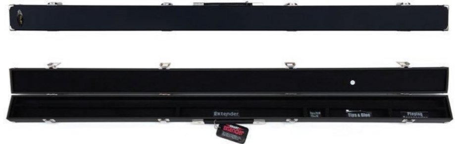
M3426 AED250 BCE Hard Case For 3 Piece Cue