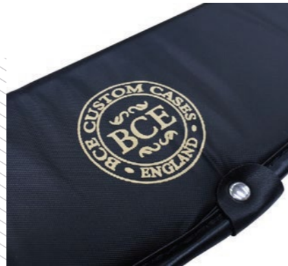
CC217-RT AED100 Riley Soft Case For 2 Piece Cue