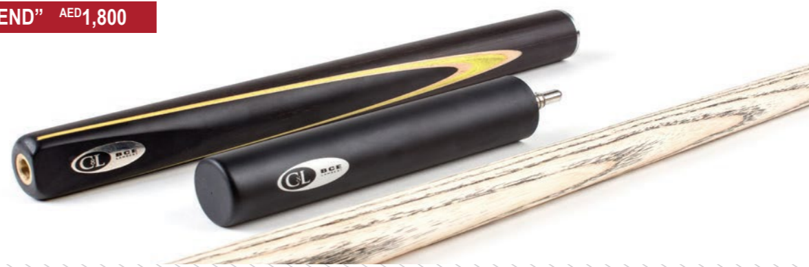
CLR-1 "LEGEND" AED1,800