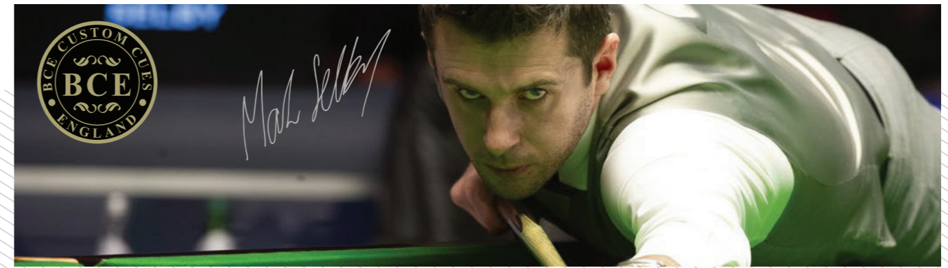
FF.150 AED 1,000