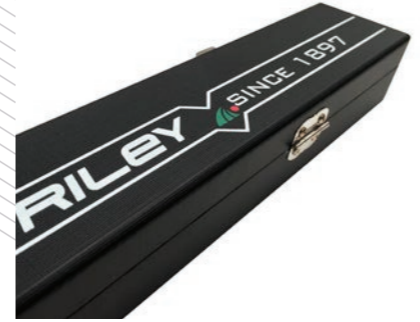
060TN-RT AED900 Riley Attaché Style Case For 2 Piece Cue