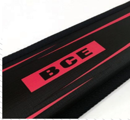
CC217-RT AED900 Riley Cue Sleeve For 2 Piece Cue