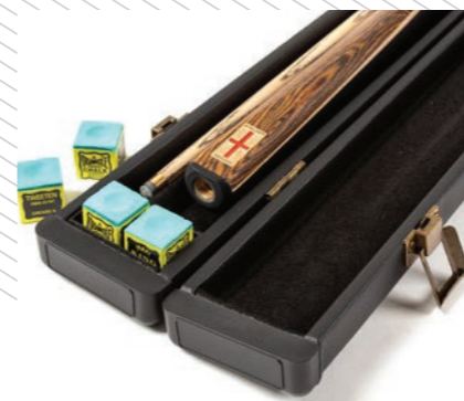
M3426-R AED950 Riley Hard Case For 3 Piece Cue