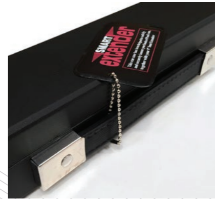
RCC3-SE AED1,000 Riley Attaché Case For 3 Piece Cue & Extension