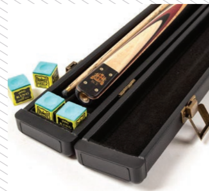
M3426 AED950 BCE Hard Case For 3 Piece Cue