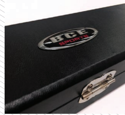
060TN AED900 BCE Attaché Style Case For 2 Piece Cue