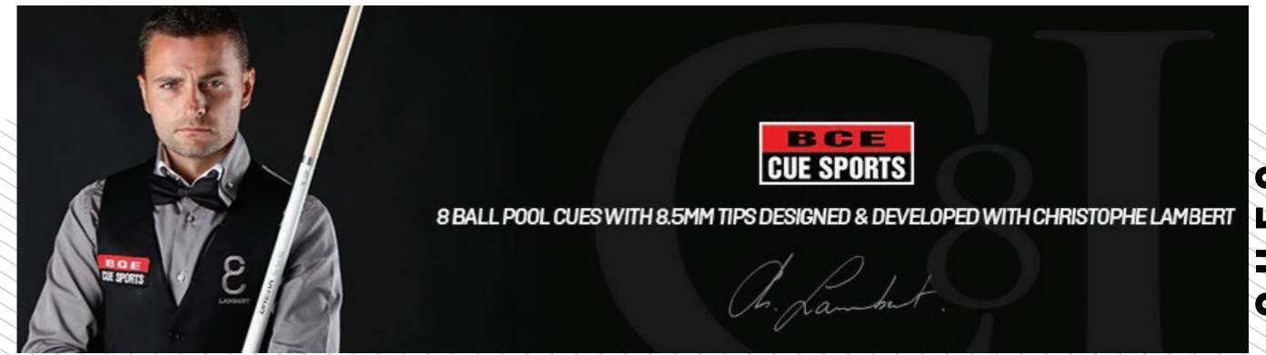
BSP-5B AED 1,000