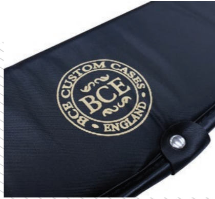
CC217-RT AED900 Riley Soft Case For 2 Piece Cue