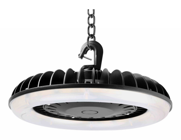
84W - 215W