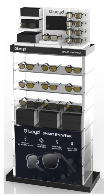
LCD006-BT10 Bookshelf Endcap Display