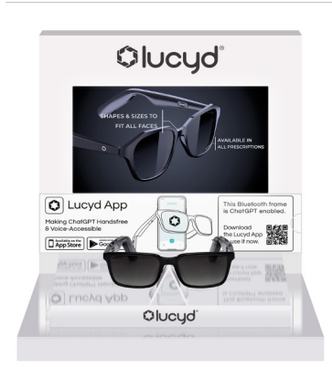
LCD006-BT Video Display Centerpiece - White