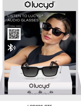
LCD006-BT5 Audio Display - White