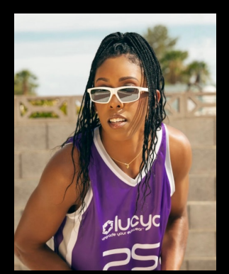
Monique Billings WNBA Pro