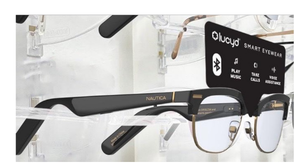
Frame Board Info Attachments

Completed Modular Display System to support any retail environment.