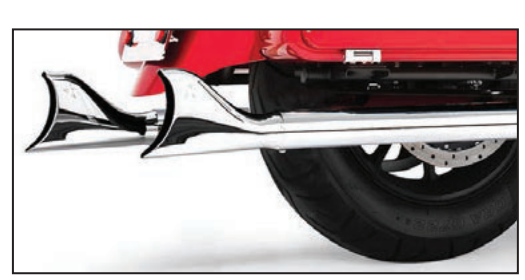
KAWASAKI 82-3119C STANDARD