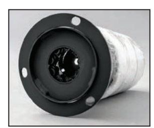
QUIET BAFFLE KIT