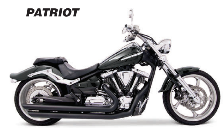
YAMAHA RAIDER 82-3305BK

Not legal for use in California on pollution controlled vehicles - Check local laws before installing