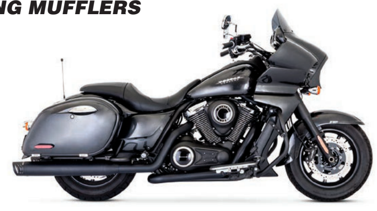
KAWASAKI VAQUERO 82-3103BK

Not legal for use in California on pollution controlled vehicles - Check local laws before installing