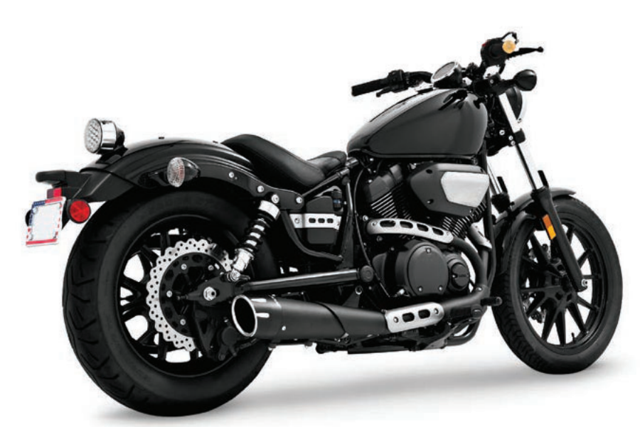
YAMAHA BOLT 82-3361BK