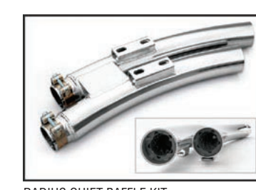
RADIUS QUIET BAFFLE KIT