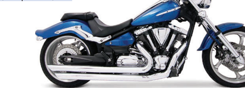
YAMAHA RAIDER 82-3305C