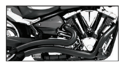
YAMAHA RAIDER 82-3302BK