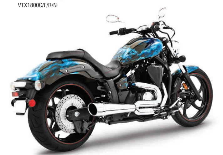
YAMAHA STRYKER 82-3323C