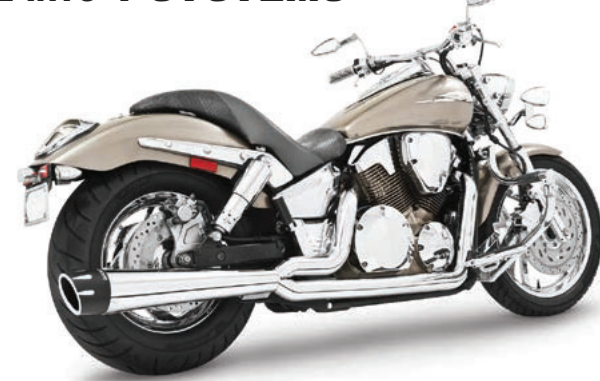
YAMAHA STRYKER (BLACK TIP)