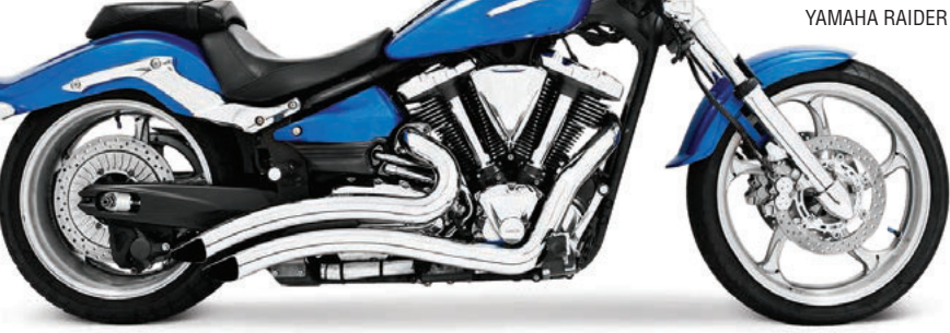
YAMAHA RAIDER 82-3302C