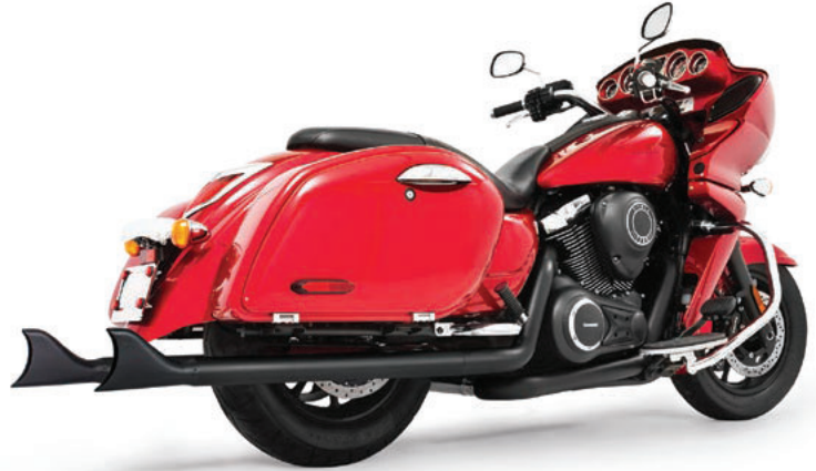
KAWASAKI 82-3117BK LONG