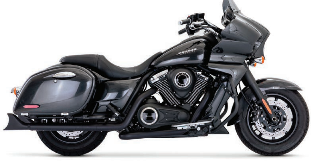
KAWASAKI 82-3119BK STANDARD