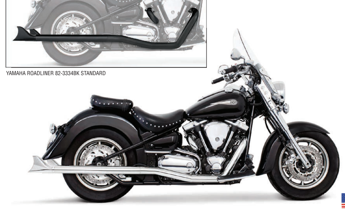
YAMAHA ROADLINER 82-3334C STANDARD