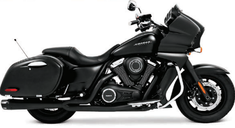
KAWASAKI VAQUERO 82-3112BK