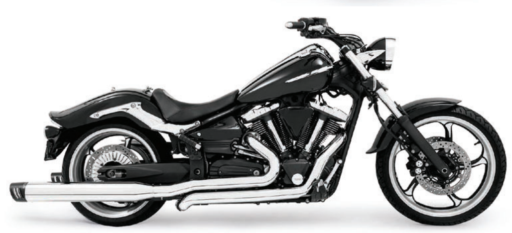
YAMAHA RAIDER 82-3309CB