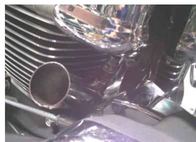
Fig 1.5 install crossover pipe