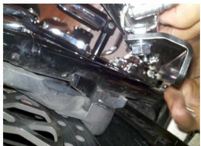
Fig 1.4 attach header to engine port and mounting bracket with 3/8 carriage bolts