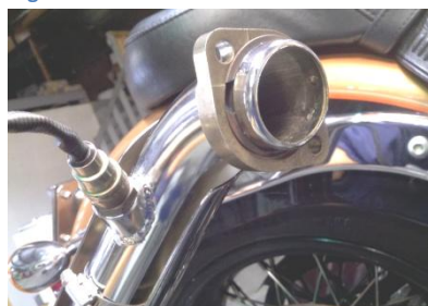
Fig 1.3 install flange and retaining ring