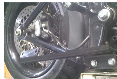
Fig 1.1 install right side bracket