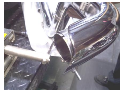
Fig 1.8 install clamp as shown on left side pipe bolt must face towards the engine to be able to be tighten

Note: Be sure to tighten all hardware before starting your engine. Retighten after the first 100 miles.