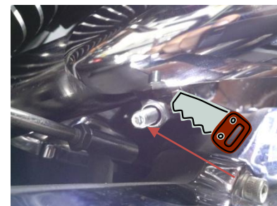
Fig 1.9 tighten T-bolt clamp and if you wish cut the end of the bolt threads flush with the nut

At freedom performance Inc. attempts have been made to provide enhanced concerning Clearances. However, due to some designs and space boundaries, ground and cornering clearance may not be improved and in some cases may even be reduced.