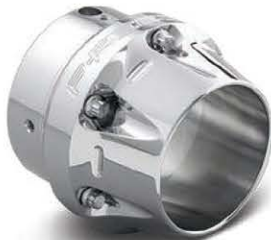
4.5" AMERICAN OUTLAW