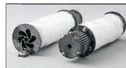
2" Quiet Baffle Kit

Not legal for use in California on pollution controlled vehicles - check local laws before installation