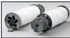
Quiet Baffle Kit