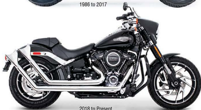
2018 to Present