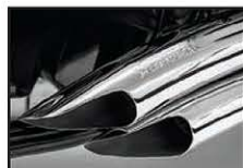
with Chrome Scallop Cut