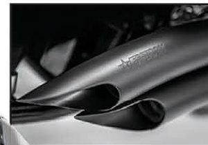
Black Scallop Cut