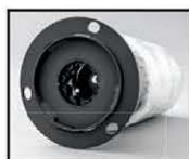
Quiet Baffle Kit