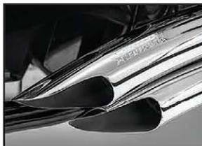
Chrome Scallop Cut

* 2014 models may require additional washer for correct spacing