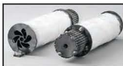
Quiet Baffle Kit

Not legal for use in California on pollution controlled vehicles - Check local laws before installing