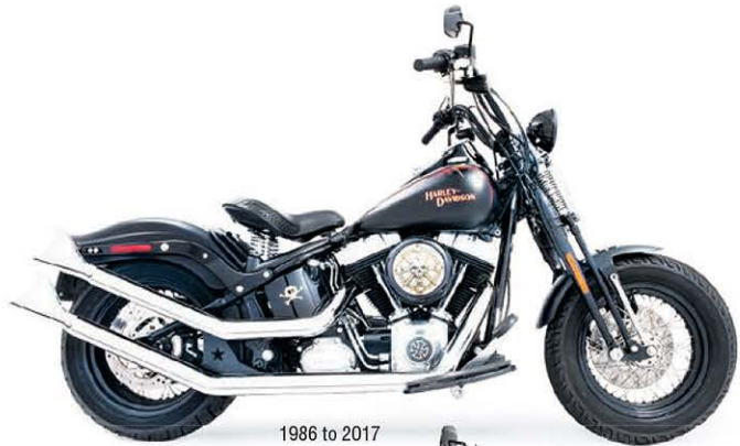
1986 to 2017