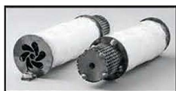
2" Quiet Baffle Kit

Not legal for use in California on pollution controlled vehicles - check local laws before installation