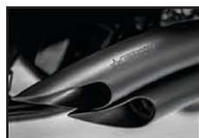
with Black Scallop Cut