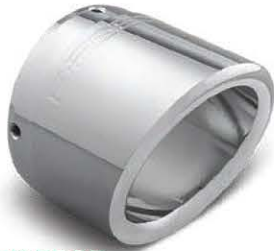
4" ROLLED EDGE