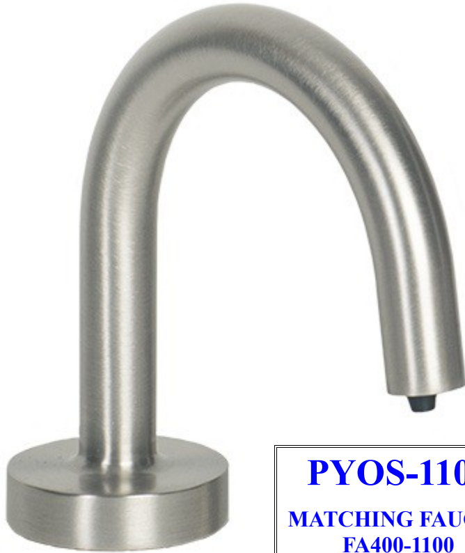
PYOS-1100 MATCHING FAUCET FA400-1100