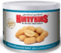
Peanuts Dry Roasted & Salted