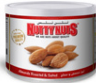
Almonds Dry Roasted & Salted