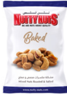
Mixed Nuts Dry Roasted & Salted