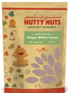
Finger Millets Cereal 250g