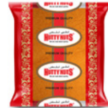
Pav Bhaji Masala