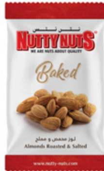
Almonds Dry Roasted & Salted