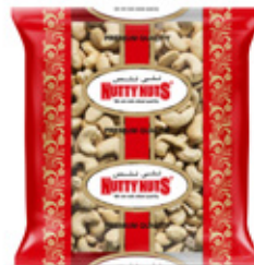
Raw Jumbo Cashew Nuts