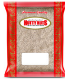
White Pepper Powder