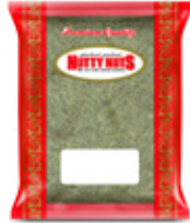
Mustard Powder Black