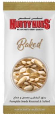
Pumpkin Seeds Dry Roasted & Salted