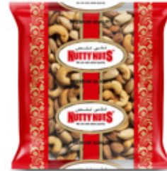
Raw Jumbo Mixed Nuts