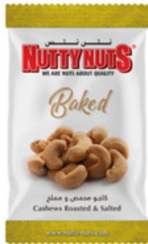
Cashew Dry Roasted & Salted