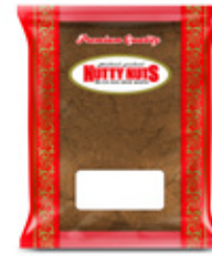
Garam Masala Powder