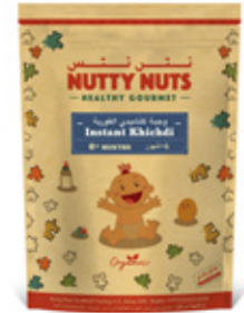
Instant Khichdi 100g