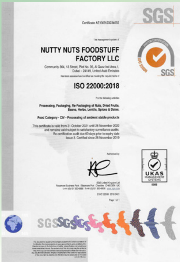
ISO 22000 CERTIFICATION