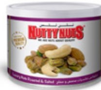
Luxury Nuts Dry Roasted & Salted