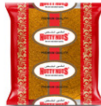
Samkeh Harra Spices