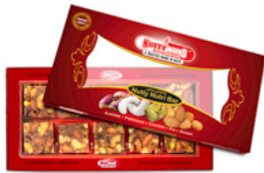
FIGS WITH NUTS