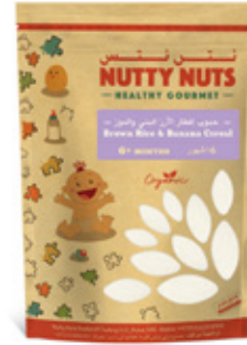
Banana & Brown Rice Cereal 250g