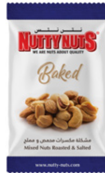
Mixed Nuts Dry Roasted & Salted