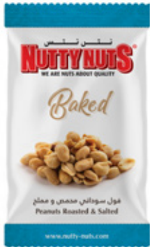
Peanuts Dry Roasted & Salted