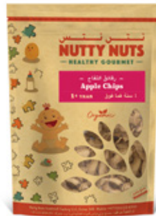
Apple Chips 40g