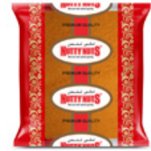
Chicken Tikka Masala