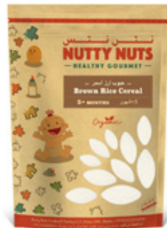
Brown Rice Cereal 250g