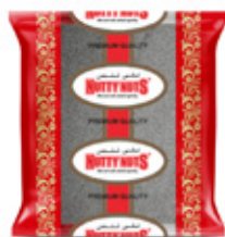
Black Pepper Crushed