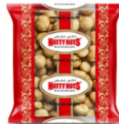
Raw Jumbo Macadamias