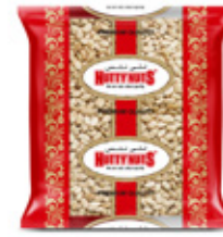
Dry Melon Seeds (Egusi)