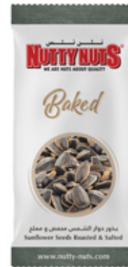
Sunflower Seeds Dry Roasted & Salted