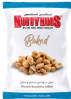
Peanuts Dry Roasted & Salted