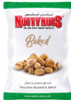
Pistachios Dry Roasted & Salted