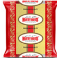
Mustard Powder Yellow