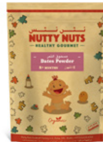
Dates Powder 100g