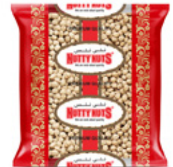
Kabuli Channa Chickpeas 12mm