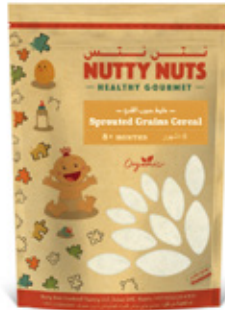
Sprouted Grains Cereal 250g