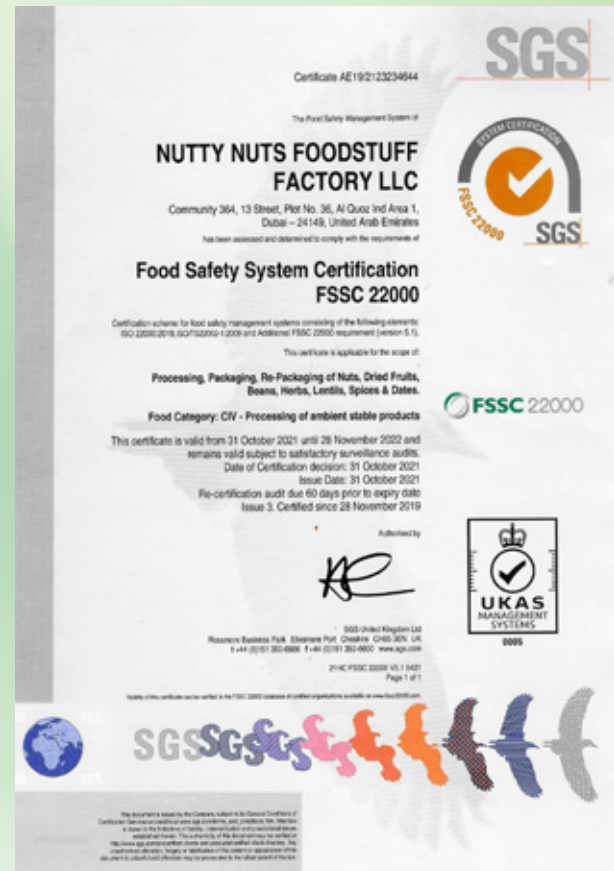
FSSC 22000 CERTIFICATION

We procure our raw materials from the best farms in the world; Almonds from USA, Cashews from India, Peanuts from Argentina and Pistachios from Iran. They are brought to our state-of-the-art processing plant where the sorting, flavoring, roasting and packaging is done using the latest machinery under hygienic conditions.