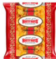
American Jumbo Raisins