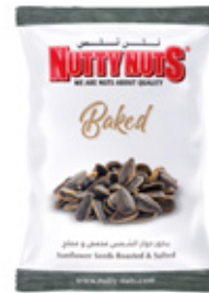
Sunflower Dry Roasted & Salted