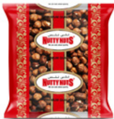
Raw Jumbo Hazelnuts With Skin