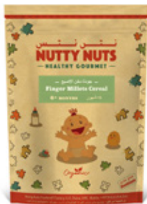
Finger Millets Cereal 100g