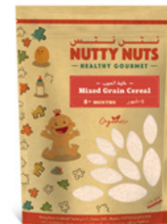
Mixed Grains Cereal 250g