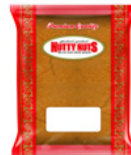
Arabic Mix Masala