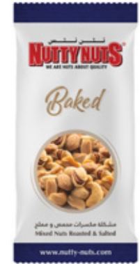
Mixed Nuts Dry Roasted & Salted