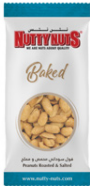
Peanuts Dry Roasted & Salted