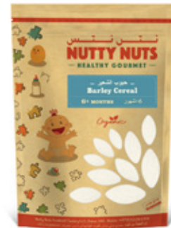
Barley Cereal 250g