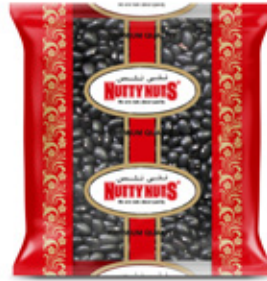
Black Eye Beans