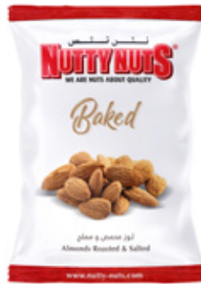
Almonds Dry Roasted & Salted