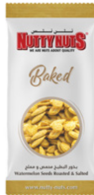
Watermelon Seeds Dry Roasted & Salted