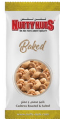
Cashew Dry Roasted & Salted