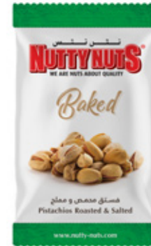
Pistachios Dry Roasted & Salted