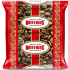
Raw Pistachio Kernels