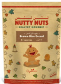
Brown Rice Cereal 100g