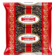
Black Pepper Whole