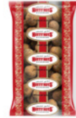
Dry Yellow Lemon