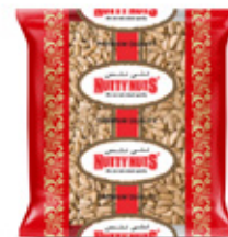
Sunflower Seed Kernels