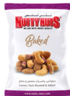
Luxury Nuts Dry Roasted & Salted