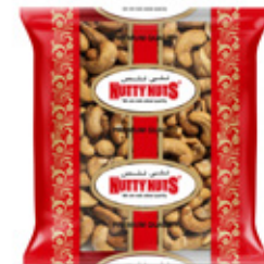
Fried Jumbo Cashew Nuts