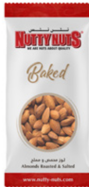
Almonds Dry Roasted & Salted