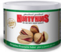
Pistachios Dry Roasted & Salted