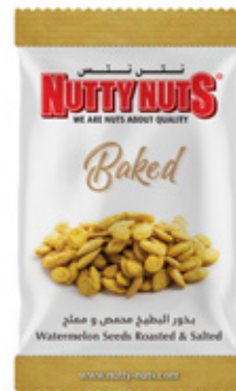
Watermelon Seeds Dry Roasted & Salted