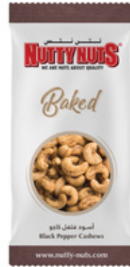
Black Pepper Cashews