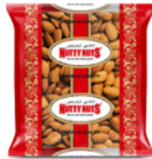
Raw Jumbo Almonds