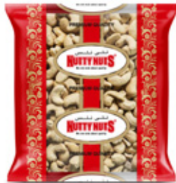
Raw Jumbo Cashew Nuts