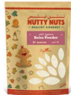
Dates Powder 250g