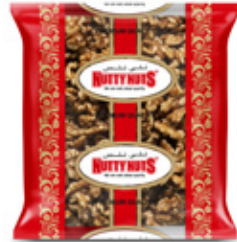
Raw Jumbo Walnuts