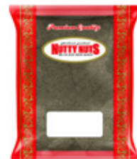
Black Pepper Powder