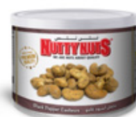
Black Pepper Cashews