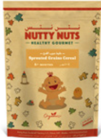
Sprouted Grains Cereal 100g