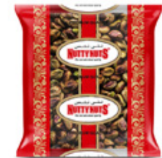
Raw Pistachio Kernels