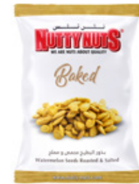
Watermelon Dry Roasted & Salted