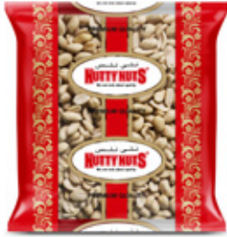
Raw Peanuts Without Skin