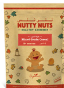
Mixed Grains Cereal 100g