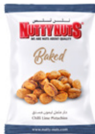
Chilli Lime Pistachio