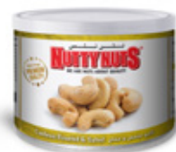
Cashew Dry Roasted & Salted