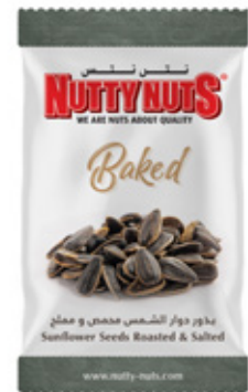
Sunflower Seeds Dry Roasted & Salted