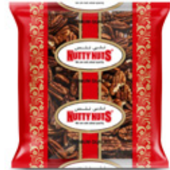
Raw Jumbo Pecan Nuts