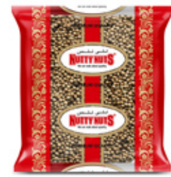
White Pepper Whole