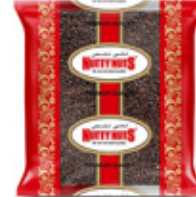
Mustard Seeds Black