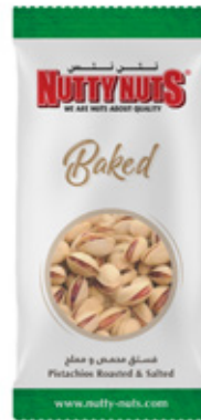
Pistachios Dry Roasted & Salted