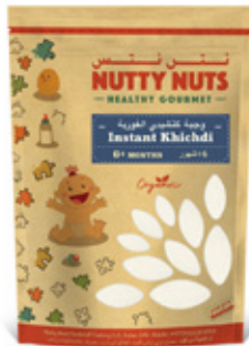
Instant Khichdi 250g