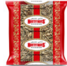
Lemon Grass Dried