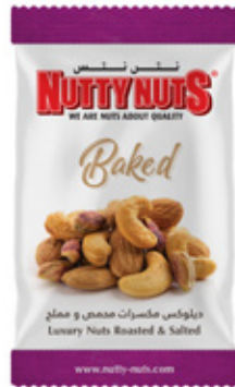
Luxury Nuts Dry Roasted & Salted