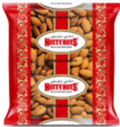
Raw Jumbo Almonds