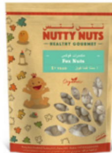
Fox Nuts 25g