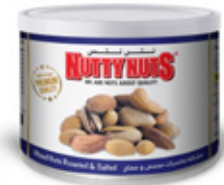
Mixed Nuts Dry Roasted & Salted