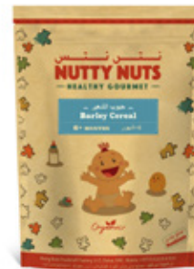
Barley Cereal 100g