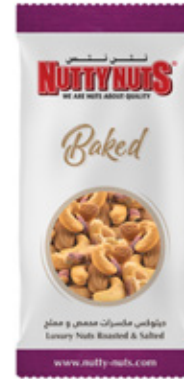
Luxury Nuts Dry Roasted & Salted