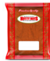
Kashmiri Chilli Powder