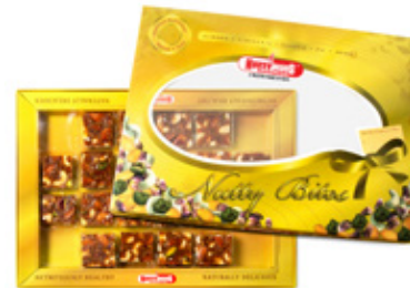
FIGS WITH NUTS