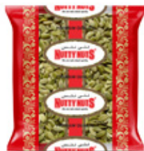
Pumpkin Seed Kernels