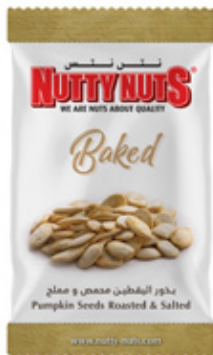
Pumpkin Seeds Dry Roasted & Salted