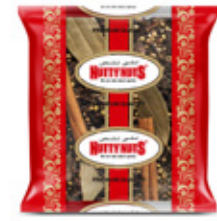
Garam Masala Whole