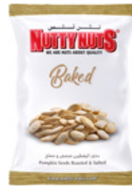
Pumpkin Dry Roasted & Salted