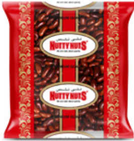
Red Kidney Beans