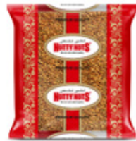
Fennu Greek Seeds