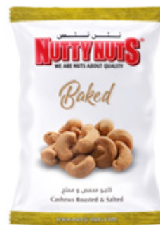
Cashew Dry Roasted & Salted