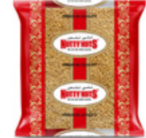
Mustard Seeds Yellow