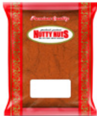
Red Cayenne Powder