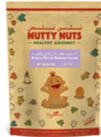
Banana & Brown Rice Cereal 100g