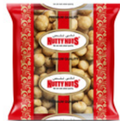
Roasted Salted Jumbo Macadamias