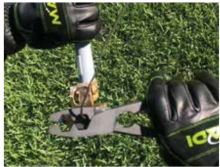
Cutting fuse tail