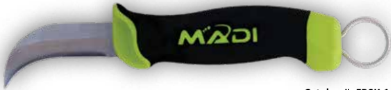
Catalog #: FBSK-1

Pointed angled blade design for maximum sharpness