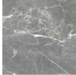
PALACE GRAY D-SC-PG