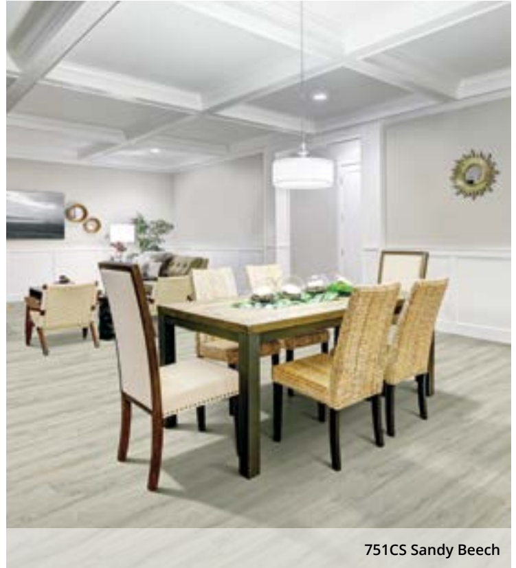
751CS Sandy Beech