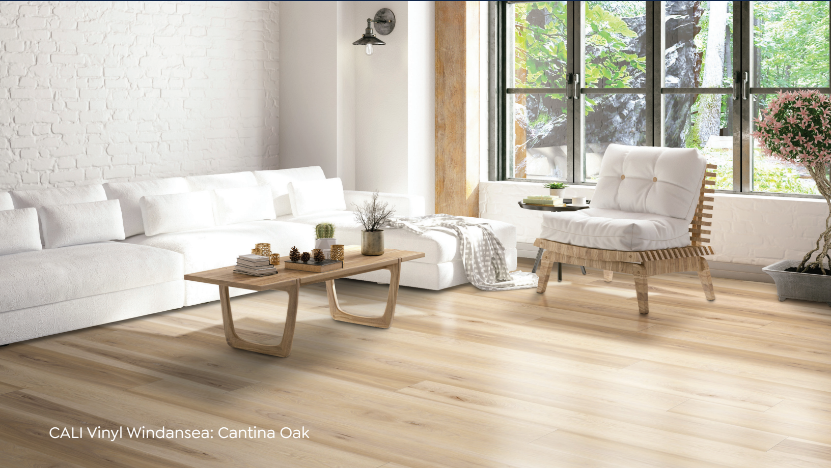
CALI Vinyl Windansea: Cantina Oak

CALI Vinyl Windansea delivers authentic hardwood beauty with attached acoustic padding lining each plank. This IXPE cushion improves sound insulation and provides for quieter steps and more comfortable rooms. Eighteen coastal-inspired colors showcase intricate wood imagery and specialized embossing that matches up with the knots and grains you see. Planks are 100% waterproof and geared for commercial grade durability with a strengthening limestone composite core. Plus, an extra-thick 20mil wear layer boosts scratch protection from all the pets, kids, and party-people in your life.