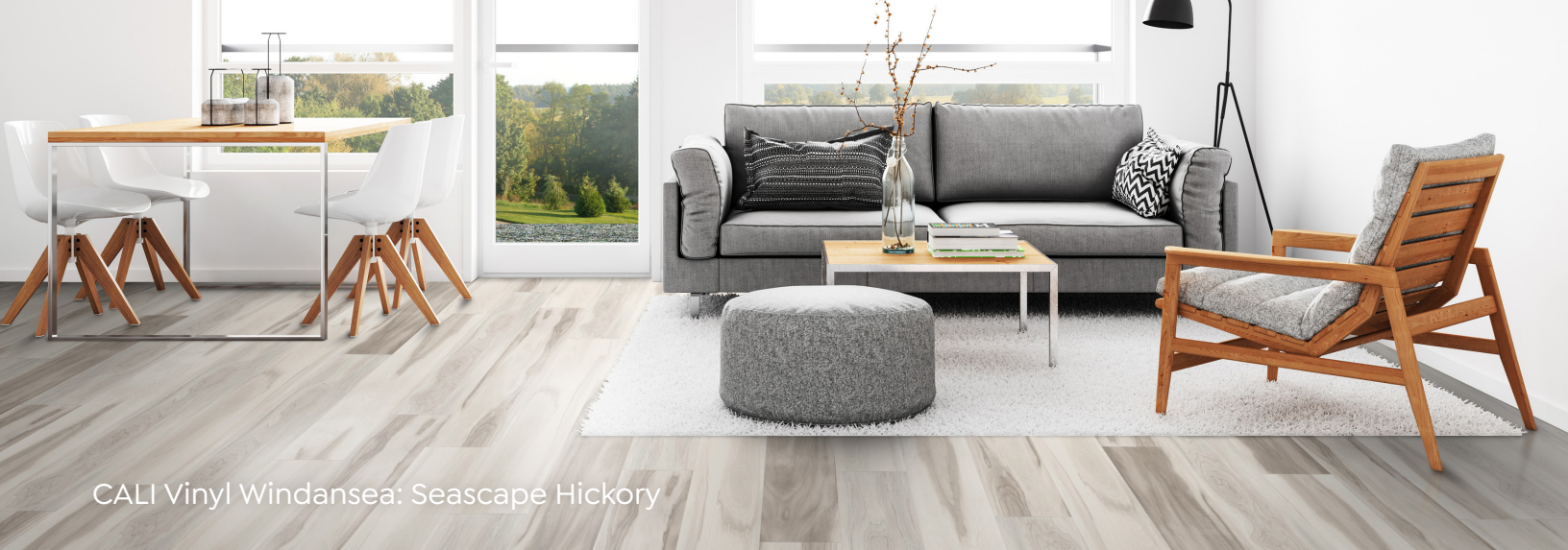
CALI Vinyl Windansea: Seascape Hickory